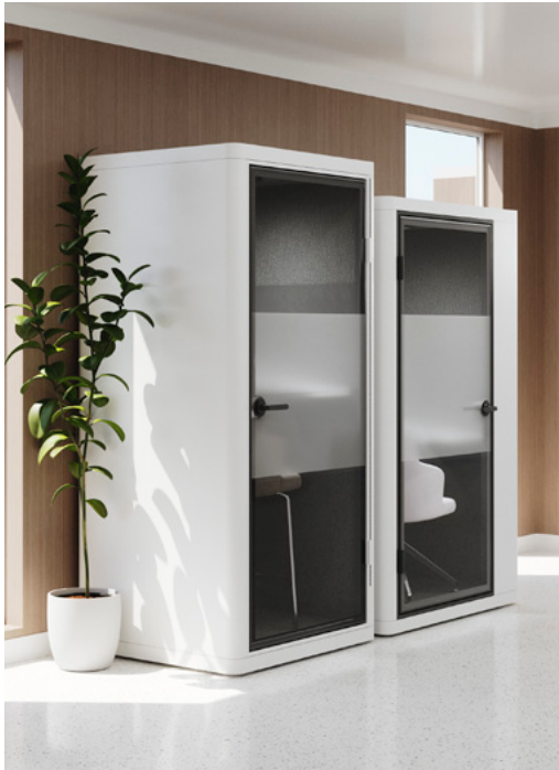
Om Pod NATIONAL