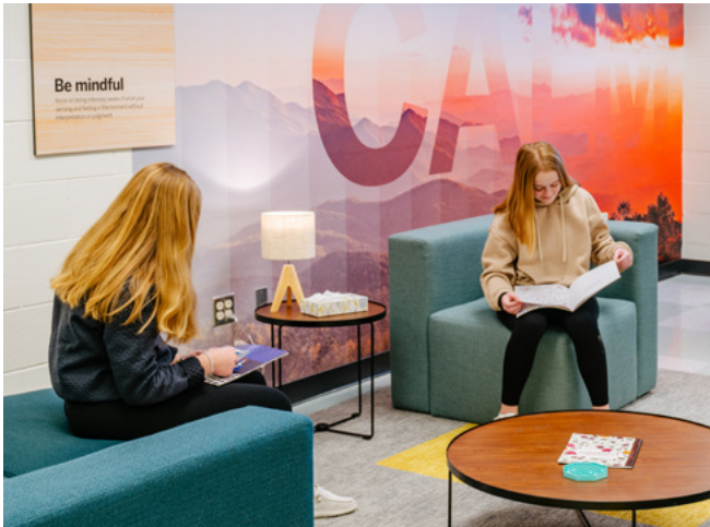
Hempstead High School, Brain Health Now Dubuque, Iowa