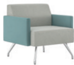
Pairings® Health interwoven