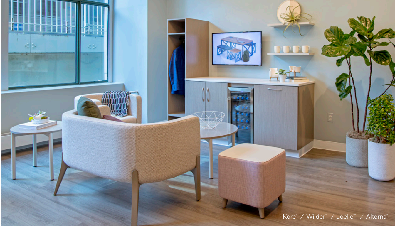
Kore® / Wilder® / Joelle™ / Alterna™