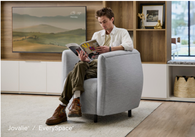
Jovalie™ / EverySpace™