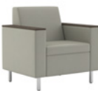
Villa™ Health interwoven