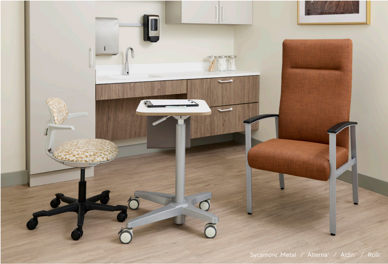
Sycamore® Metal / Alterna® / Aidin® / Rolli®