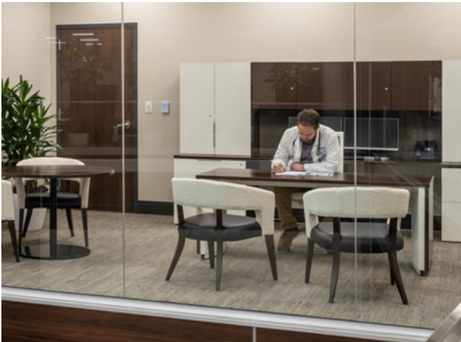
Baptist Health Little Rock, Arkansas