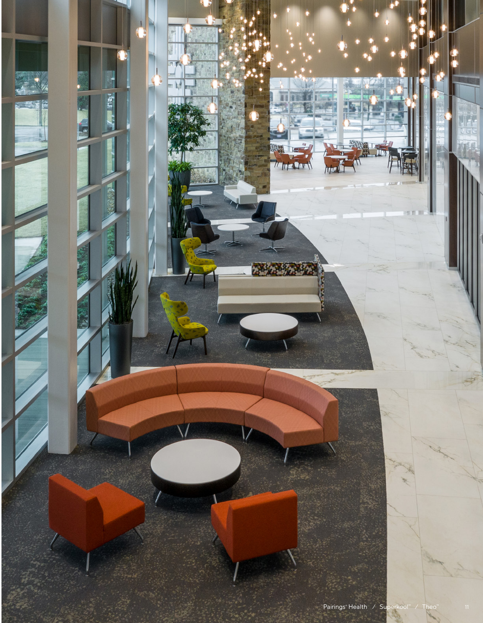
Pairings™ Health / Superkool™ / Theo™