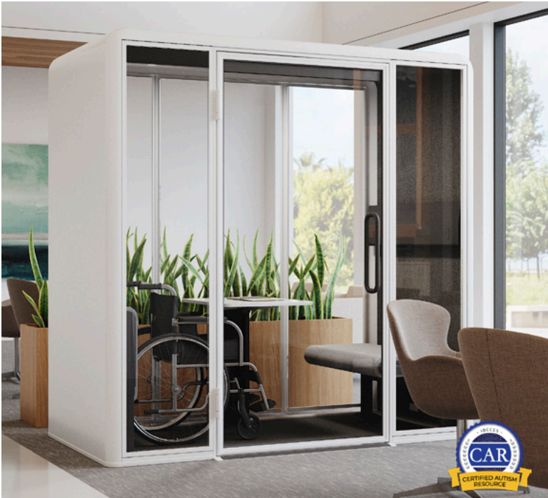
Kolo Pod NATIONAL