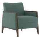
Spruce™ Behavioral Wellness interwoven