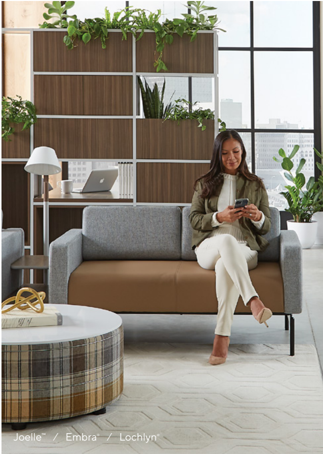
Joelle™ / Embra™ / Lochlyn™