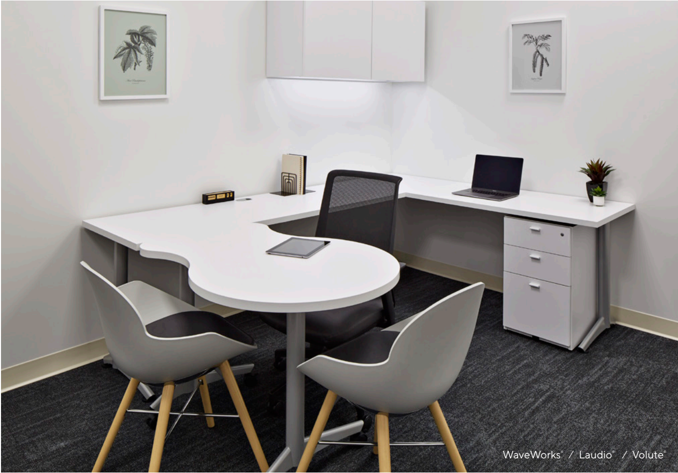
WaveWorks / Laudio / Volute

Studies show that staff satisfaction with safety is closely linked to environmental factors like clear signage, comfortable furniture, clean surroundings, and thoughtful spatial layout. Elements such as team visibility, staff privacy, and positive distractions not only support staff well-being but also enhance perceptions of safety, making design a critical part of healthcare planning.