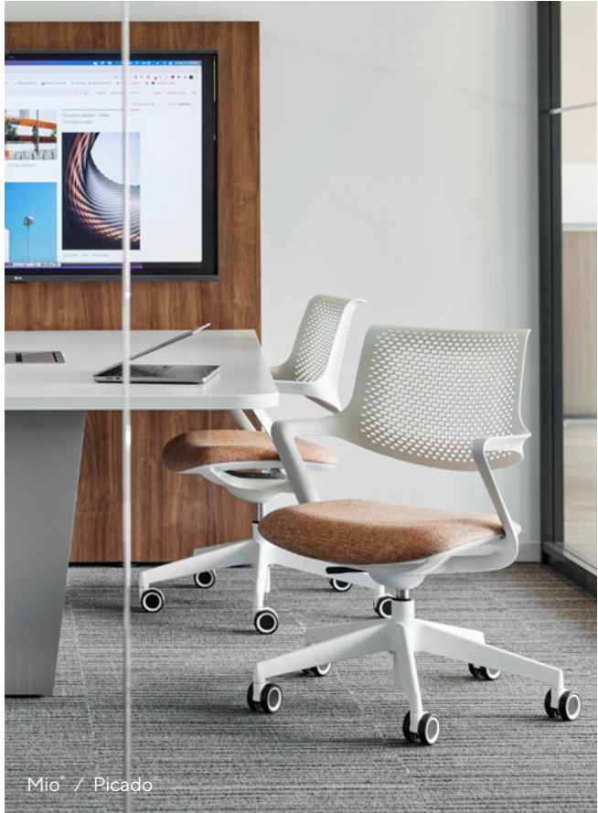
Mio / Picado