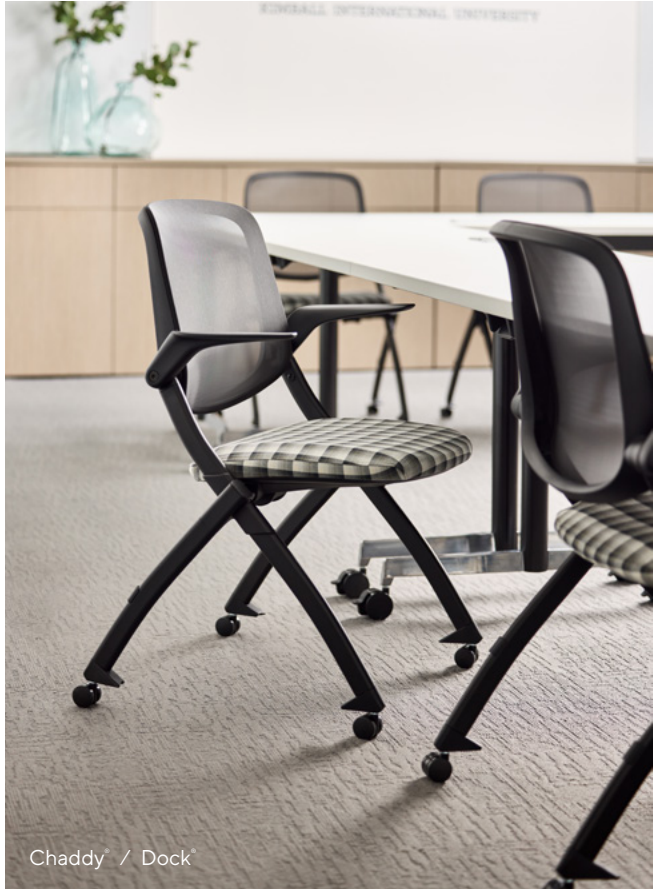
Chaddy / Dock