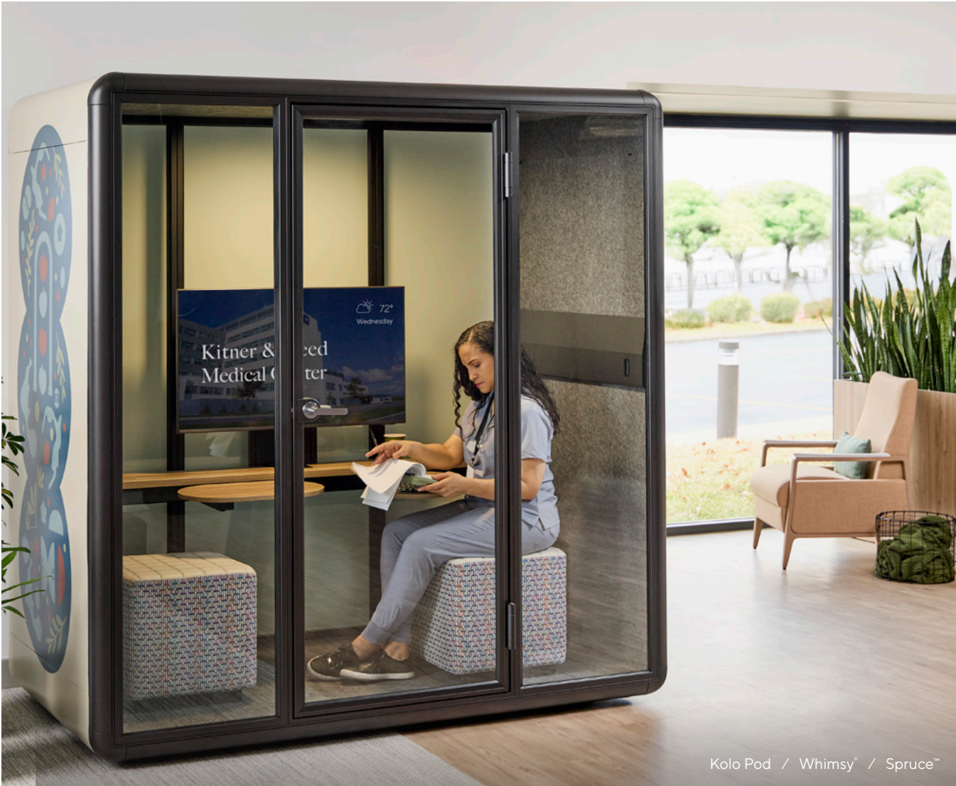
Kolo Pod / Whimsy™ / Spruce™