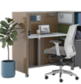
Kore® Work Cart Kimball