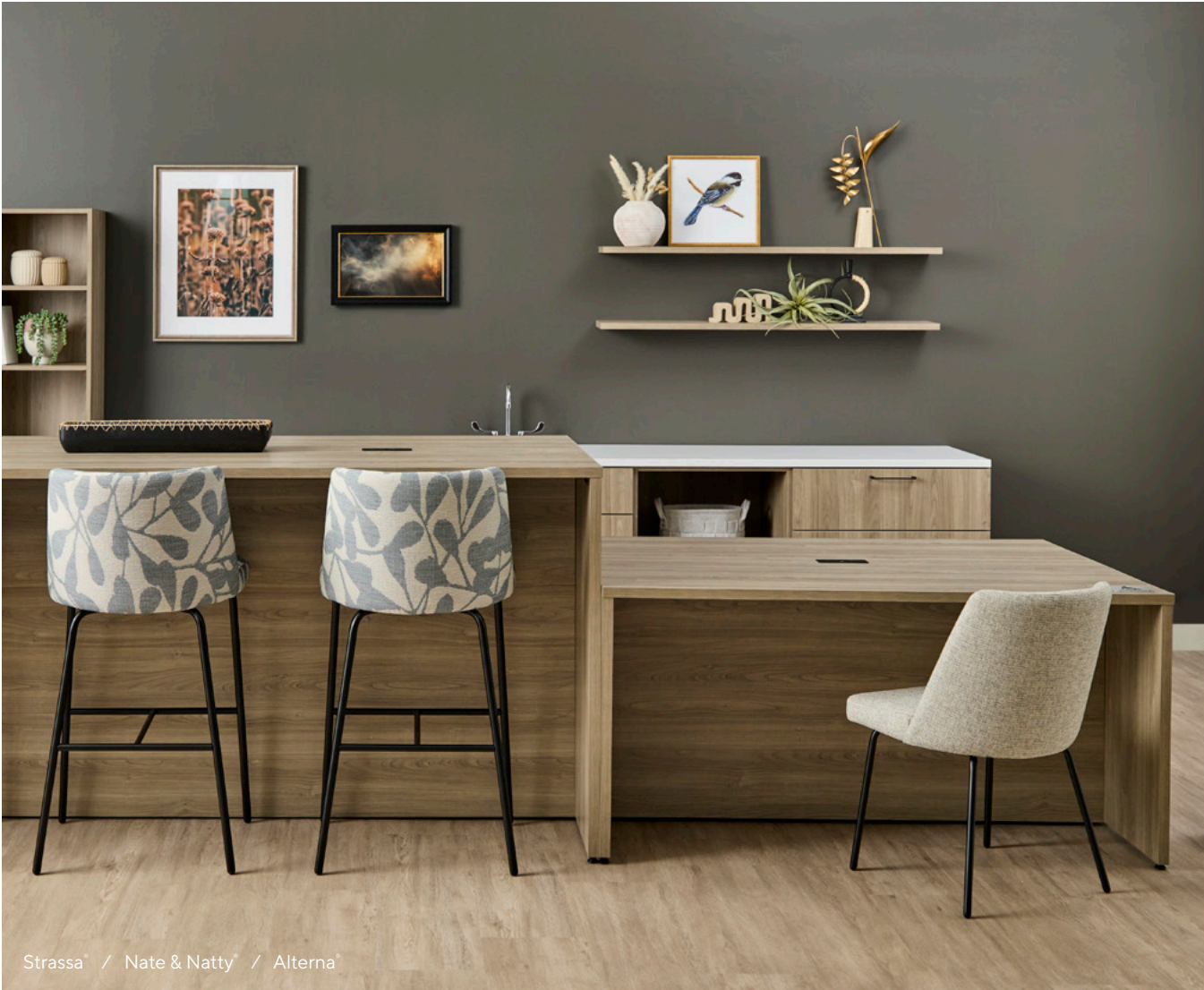
Strassa® / Nate & Natty® / Alterna®