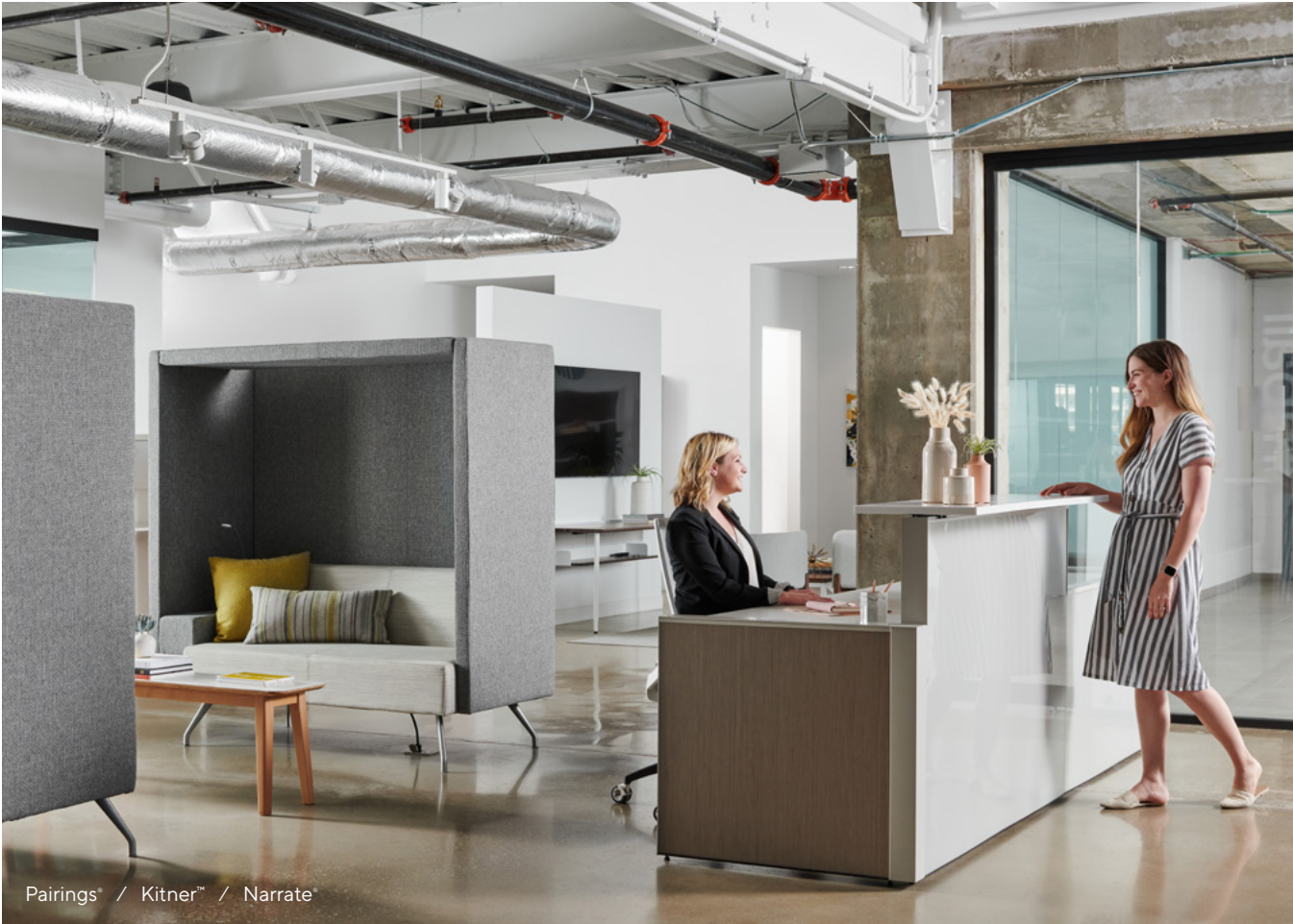
Pairings™ / Kitner™ / Narrate™