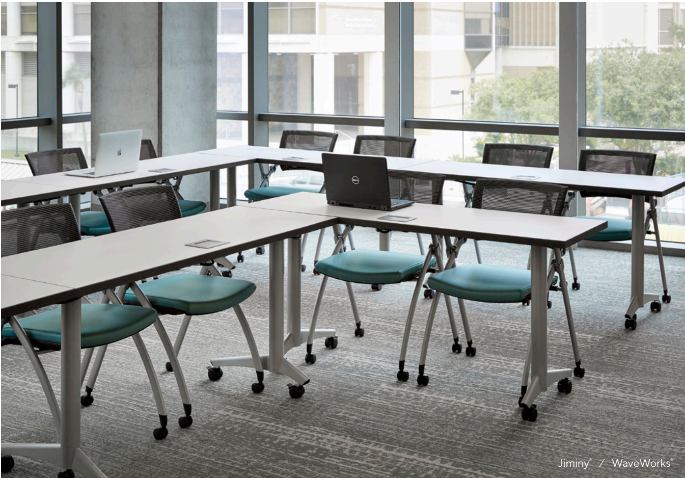
Jiminy / WaveWorks