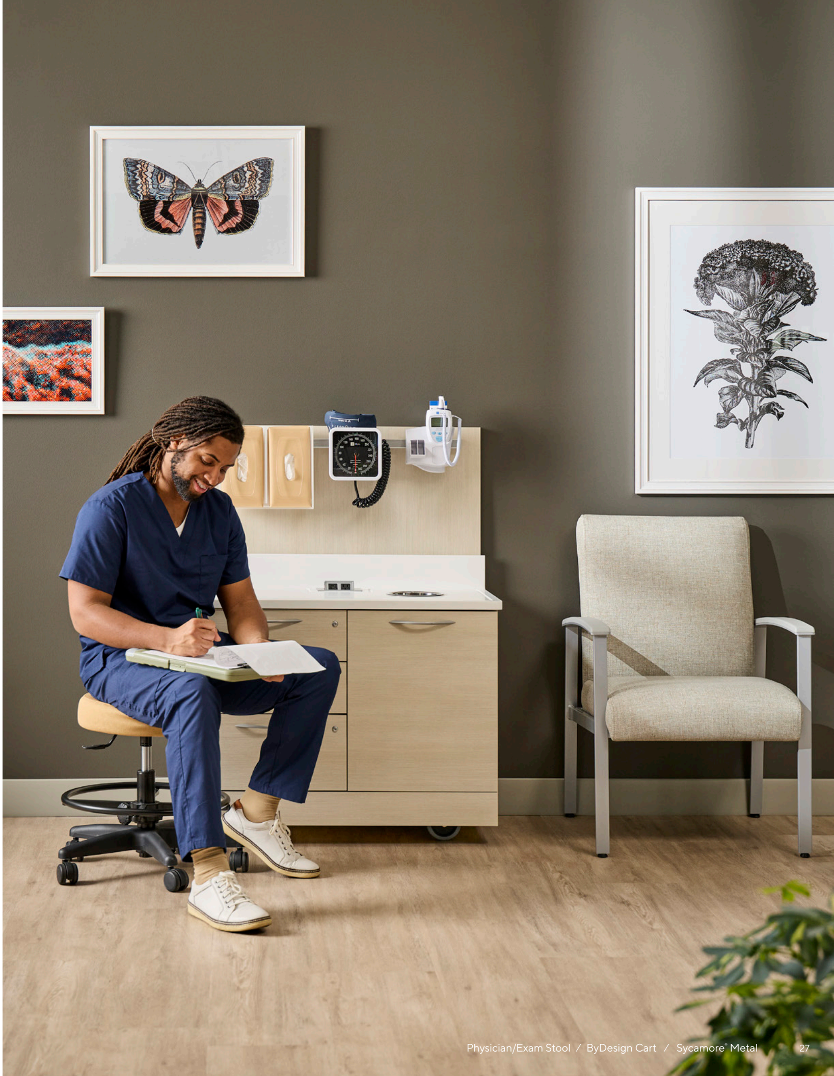
Physician/Exam Stool / ByDesign Cart / Sycamore® Metal