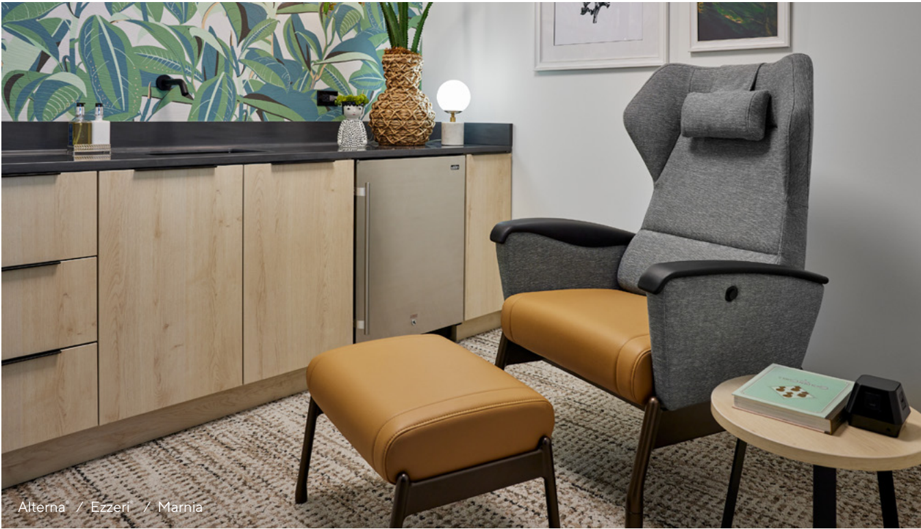
Alterna® / Ezzeri® / Marnia