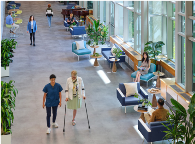
Evergreen Health Family Maternity Center Kirkland, Washington