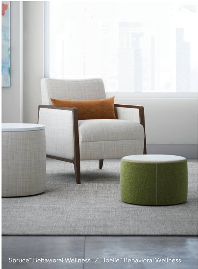
Spruce™ Behavioral Wellness / Joelle™ Behavioral Wellness