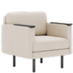
Connolly® 2.0 NATIONAL