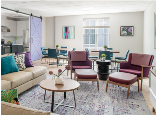
Atrium Health Florence Crittenton Services Charlotte, North Carolina