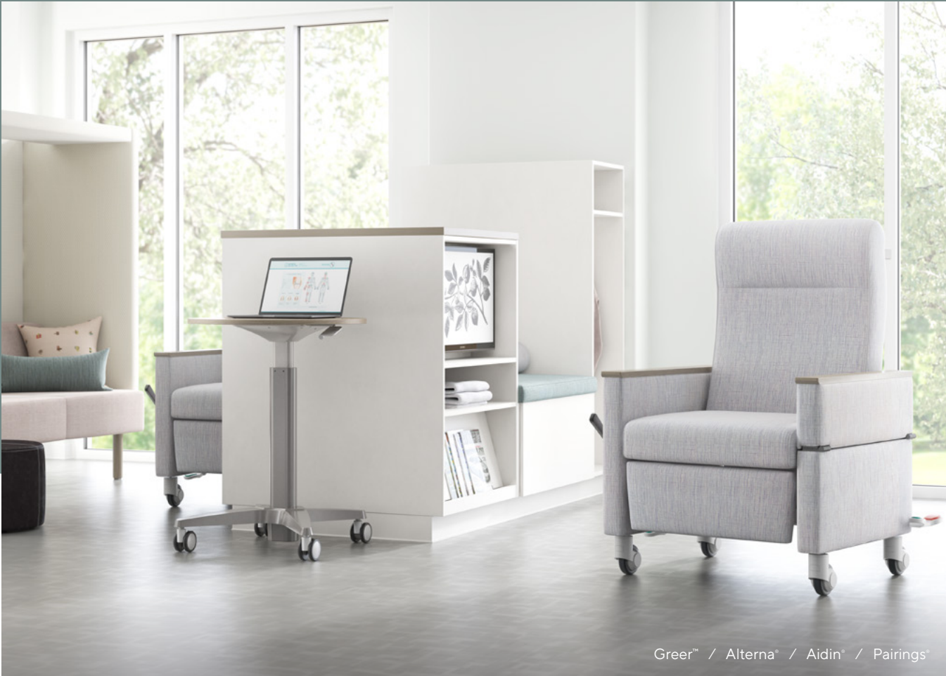
Greer™ / Alterna® / Aidin® / Pairings®