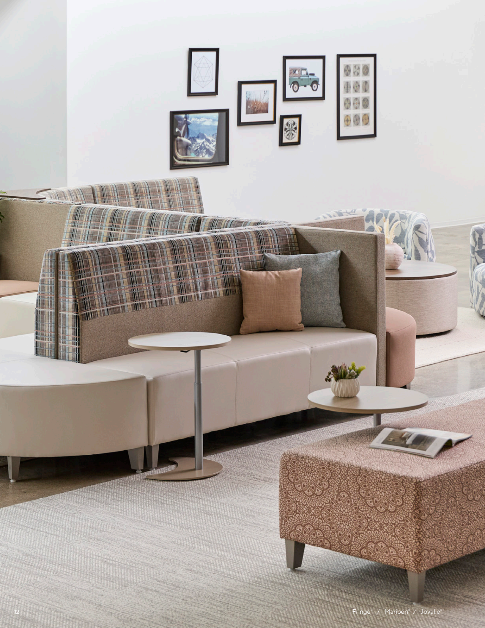
Fringe® / Mariben® / Jovalie®