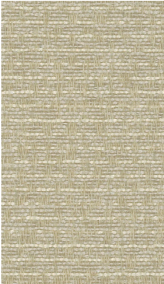
10266 Sand Dollar