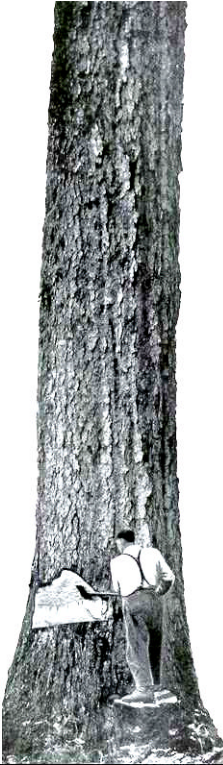
“Maybe I can turn a few pens from this-here piece of wood”

In keeping with the traditional April fools day Celebration, we have a few comments on woodworking! Look carefully at our header too.