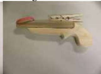
Air compression (l) and elastic (r)shooters.