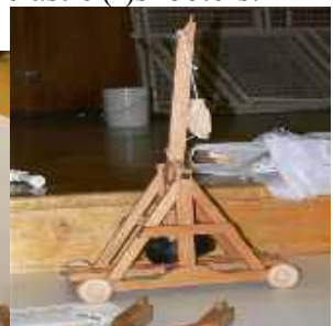
Trebuchet and slingshot by Dan Gallo