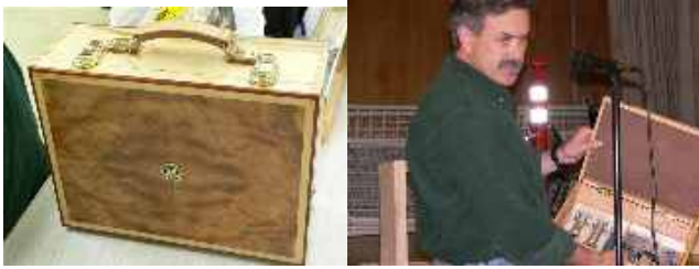
Rotary tool case by Andrew Purdy