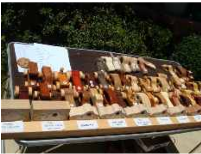
The picture to the left displays samples of the type of toy cars that were made during the workshop.