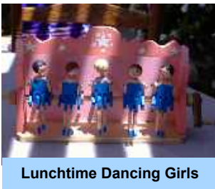
Lunchtime Dancing Girls