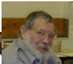
Cleveland Makes Toys