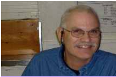
REALITY WANTS TO WIN