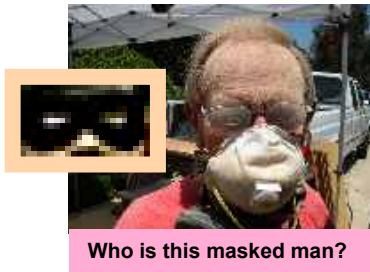
Who is this masked man?

One last note. We are trying to identify an individual who showed up and worked real hard during the workshop. As you can see from the picture to the left, this woodworker really did some serious sanding. If you can ID him give me a call.