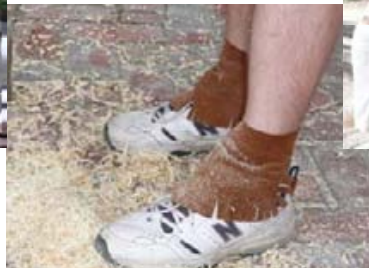
PRESIDENTIAL PICNIC FEET