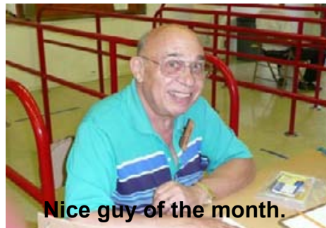
Nice guy of the month.