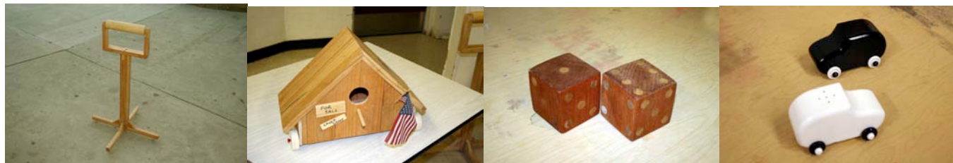
Jame's Kostrab: outfeed roller, rolling birdhouse, and HiRoller dice. Dan Waingros: salt & pepper.

September's Challenge was "Something of wood that rolls" Most of the show and tell items fell in that category also, for example James Kostrab's all wood outfeed roller. Below are some examples of both the Challenge, and show & tell.