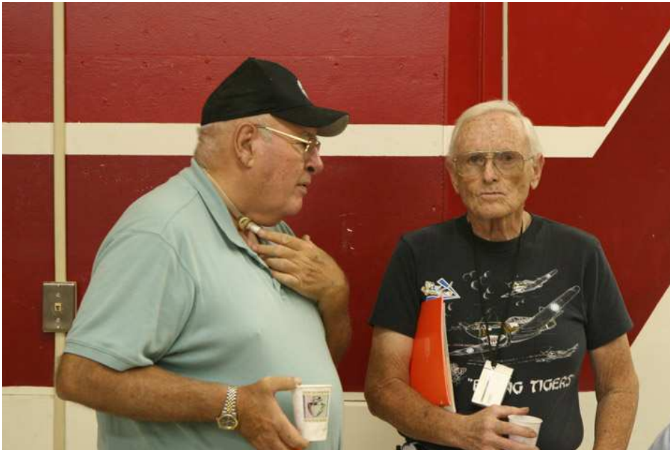
You did WHAT?????