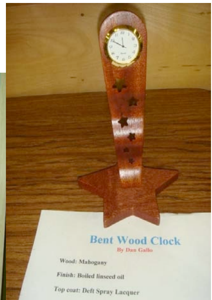
Bent Wood Clock By Dan Gallo Wood: Mahogany Finish: Boiled linseed oil Top coat: Deft Spray Lacquer