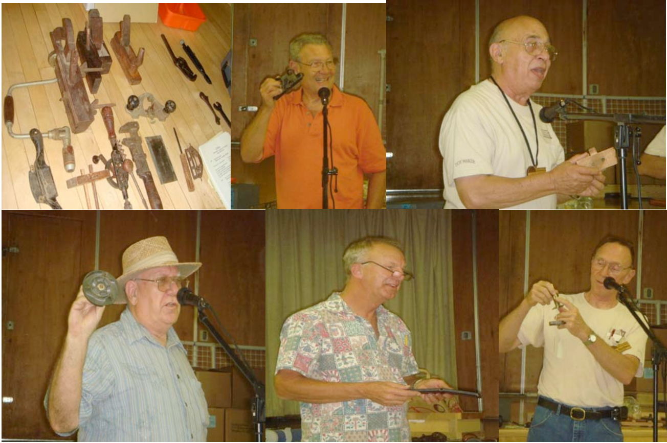
From "Show n' Tell at the September meeting: