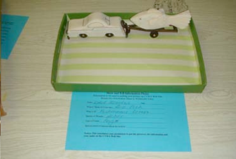
Dale Iddings' car and trailer