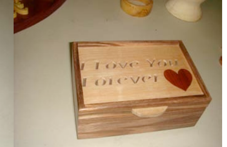
Dan Waingrow's valentine box