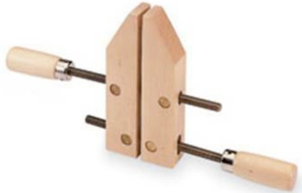
Woodworker's Hand Screw