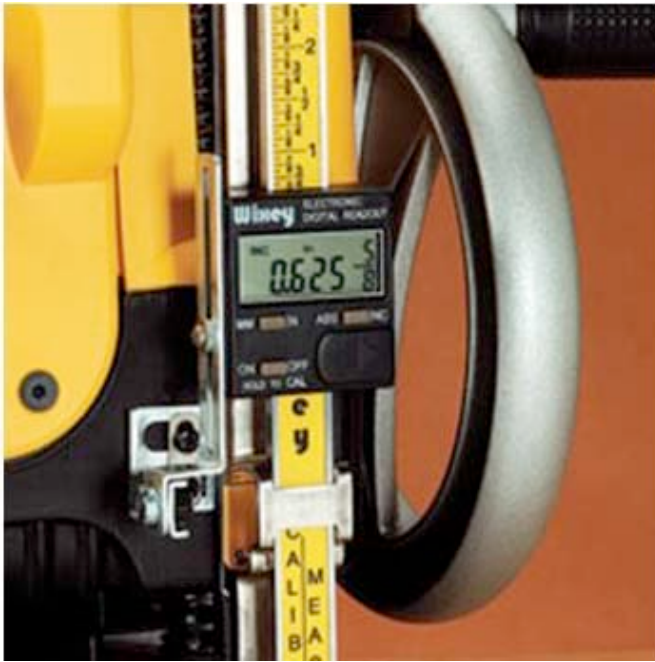
Wixey Digital Planer Height Gauge