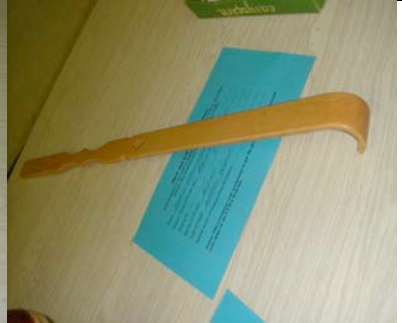
Dale Iddings' backscratcher