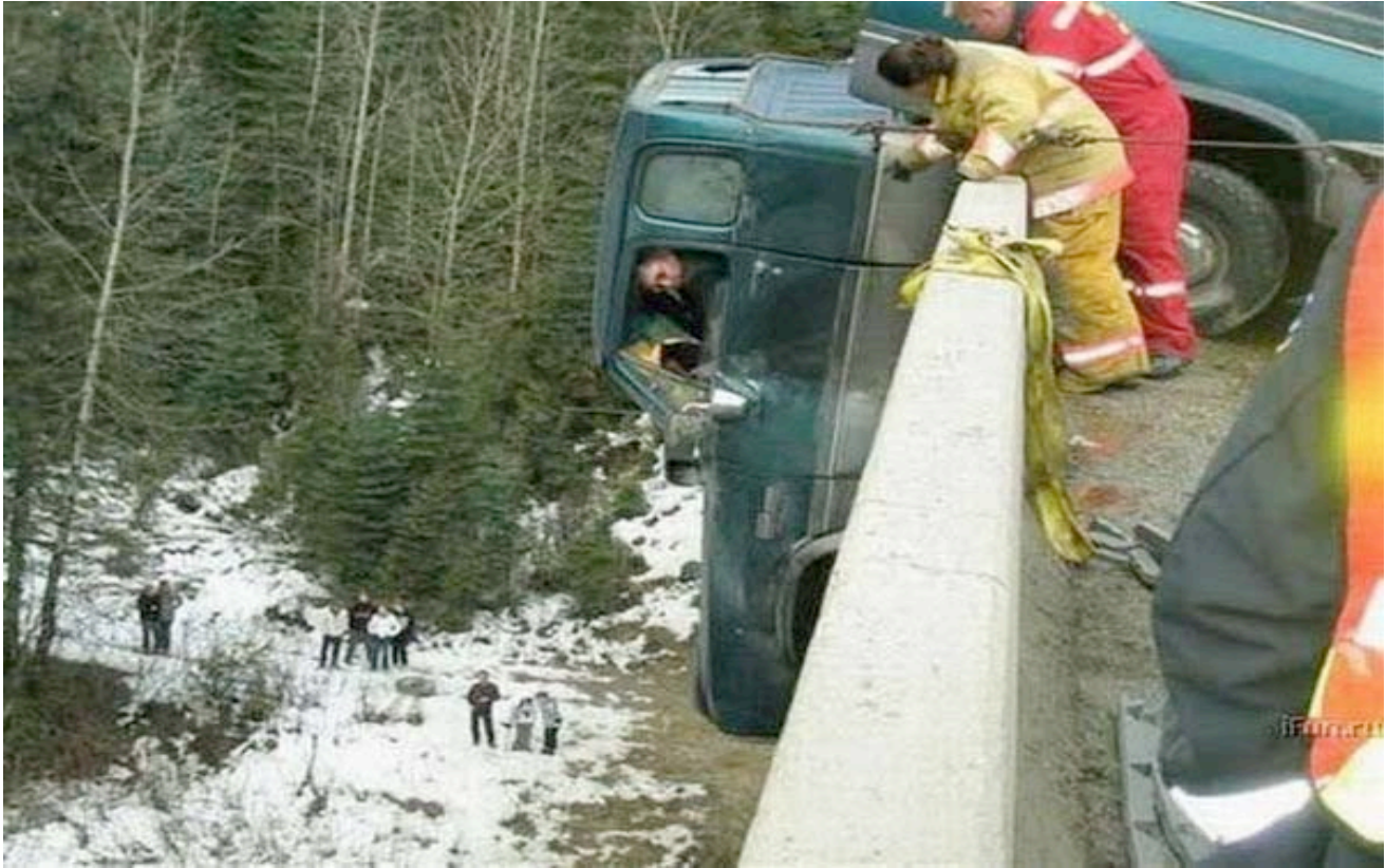
Uh, sir, is your seatbelt fastened? By the way, how big were the two beers you had?