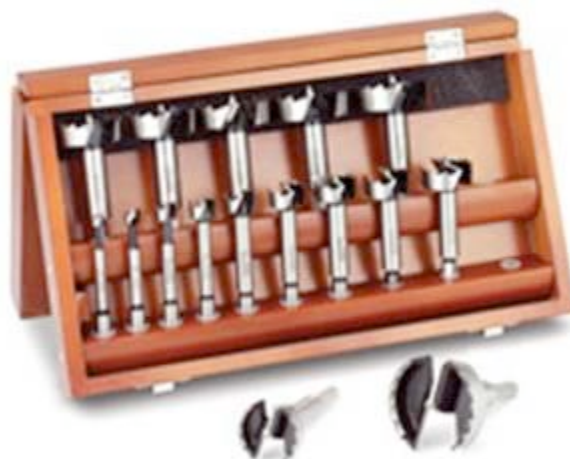
Complete set of Forstner-type bits