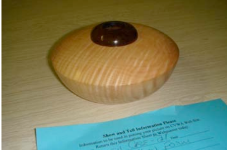
Stephen Case-Pall's hollow form