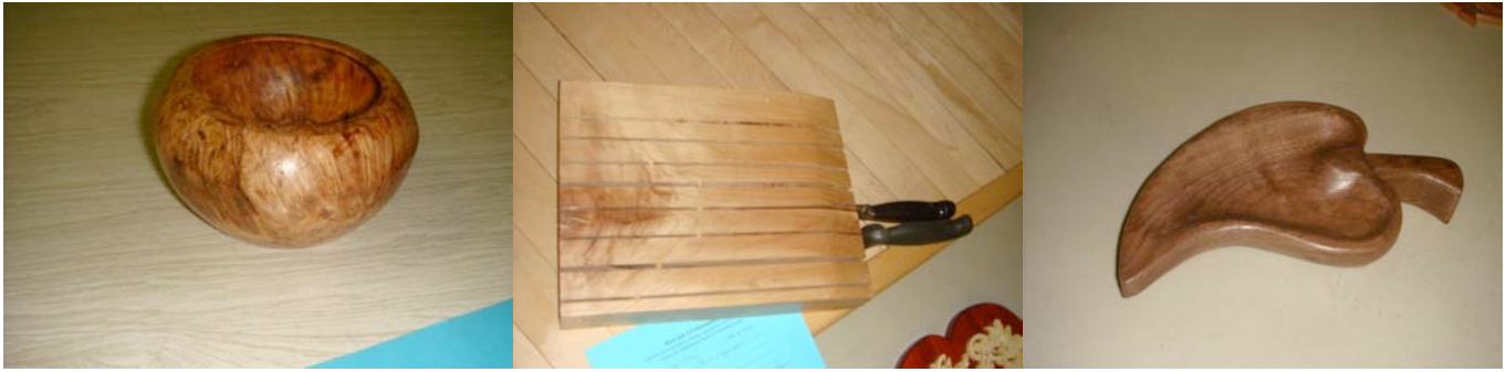
Stephen's Tasmanian Eucalyptus Burl Aubrey's knife holder