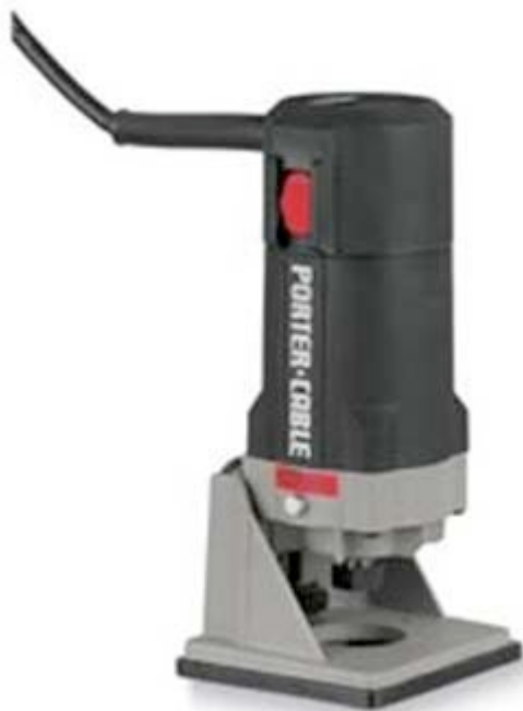
Porter-Cable Laminate Trimmer

For the March raffle Bill has secured the following prizes: