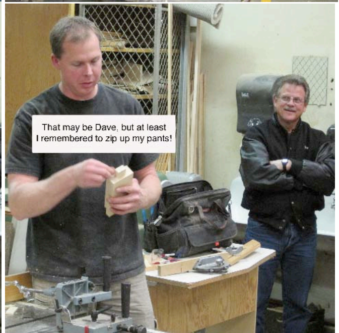
That may be Dave, but at least I remembered to zip up my pants!