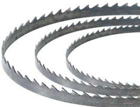
Olsen Band Saw Blade Assortment for 14" saws