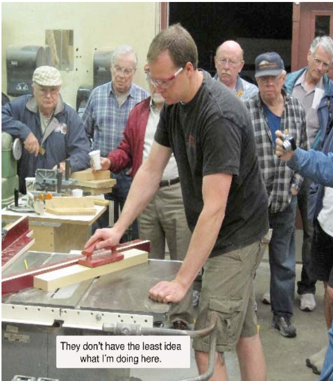
They don't have the least idea what I'm doing here.