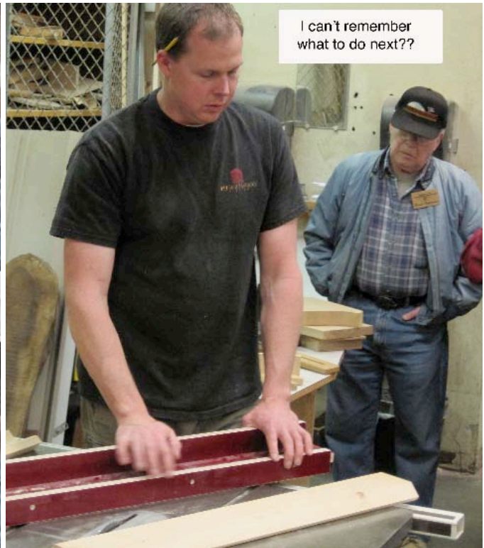
I can't remember what to do next??