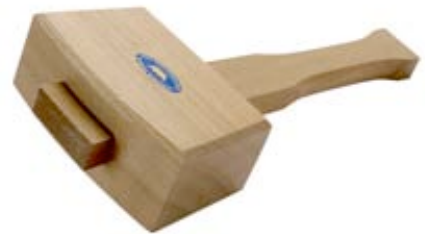
Crown beechwood woodworking mallet