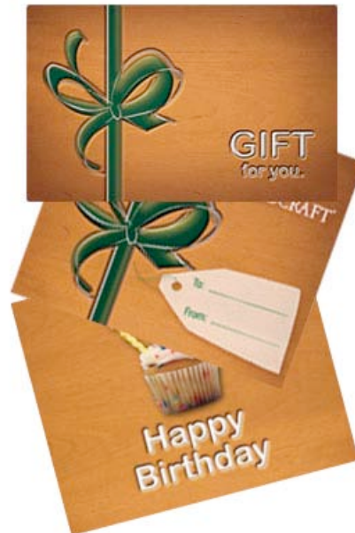
Woodcraft $100.00 Gift Certificate