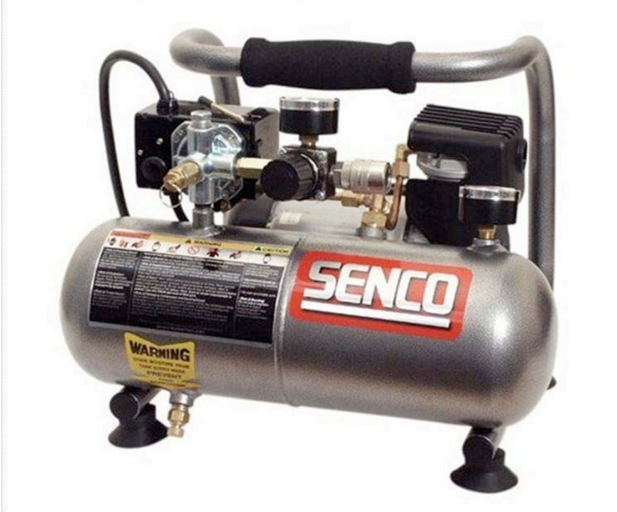
Senco 1hp, 1 gallon air compressor