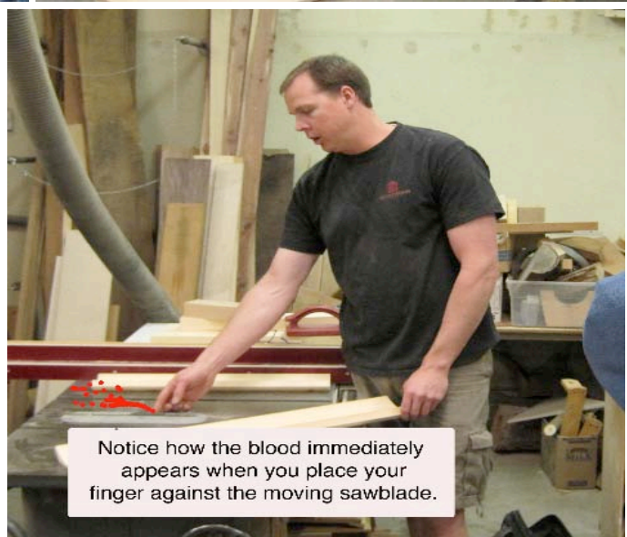
Notice how the blood immediately appears when you place your finger against the moving sawblade.