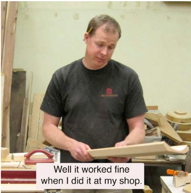
Well it worked fine when I did it at my shop.