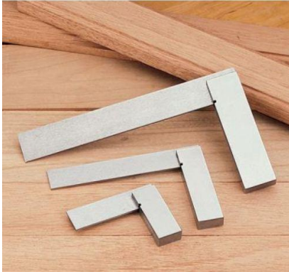
3 Piece Engineers Square Set