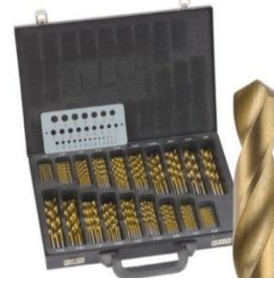
170 Piece Tin Coated Hss Twist Drill Bit Set