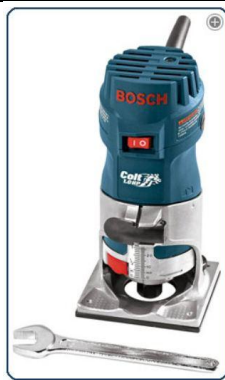
Bosch Colt PE10E Single-Speed Palm Grip Router