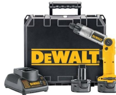
Dewalt DW920K-2 one quarter inch 7.2 Volt Cordless Screwdriver Kit