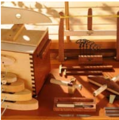
Available Swan Tools