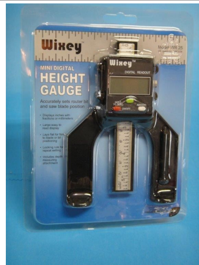
Digital Height gauge