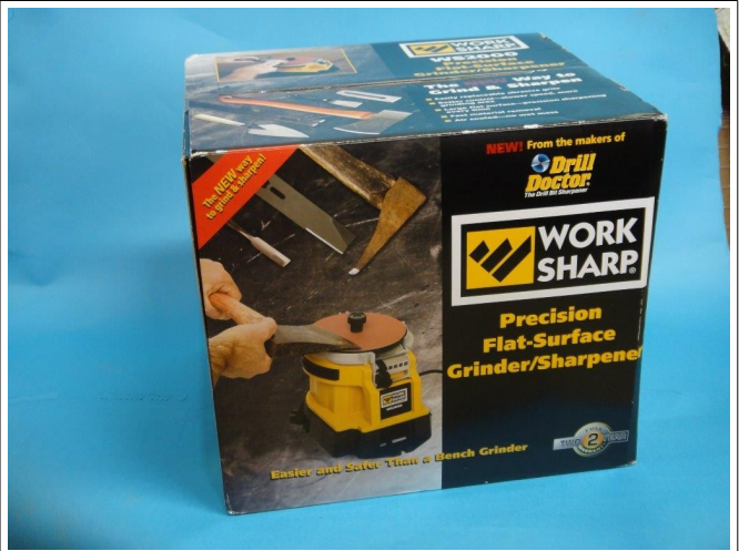
Flat surface grinder/sharper