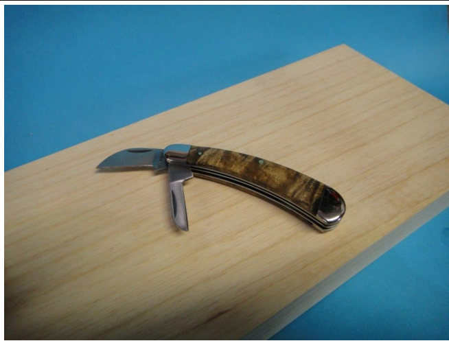
Sarge whittling knife and basswood blank