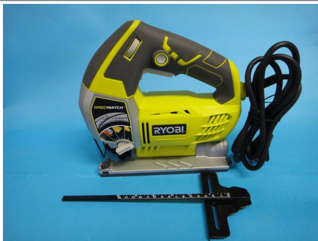
Ryobi sabre saw