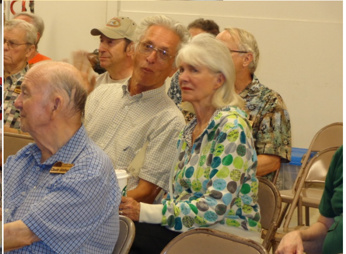
Members plan their bids