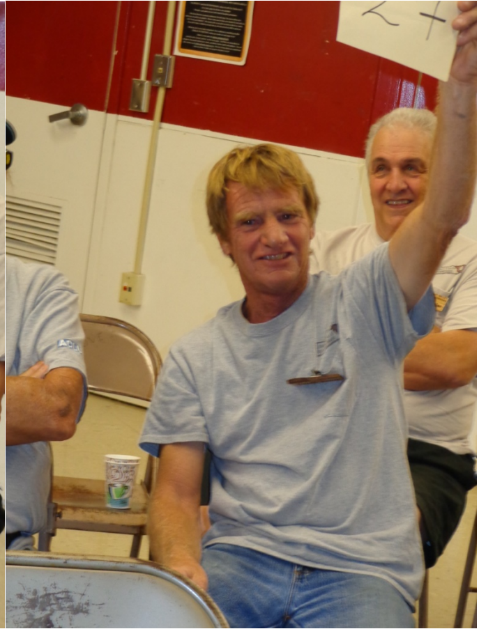
Got it! Number 24 strikes again!