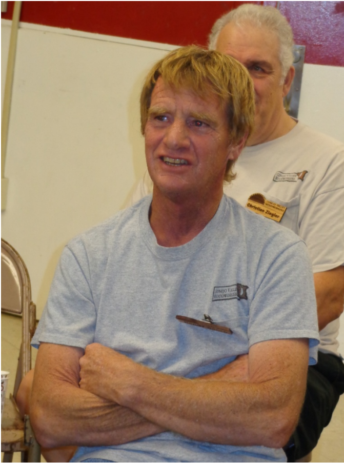
Concentrate! Wait till he says "Going once"