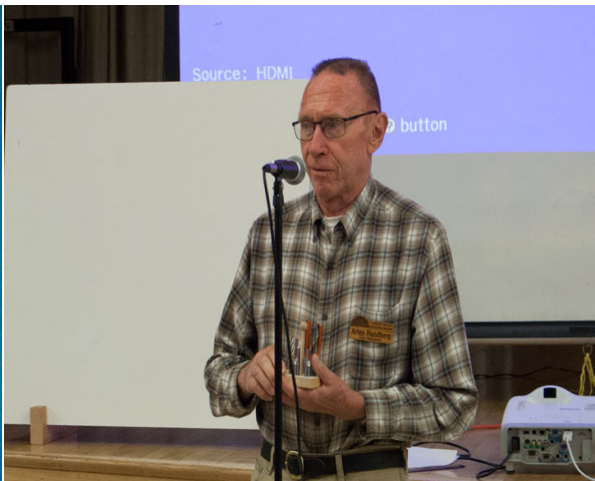
Arlen Handberg's router bit holder