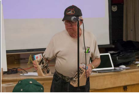
Dick Harmon's tool holders