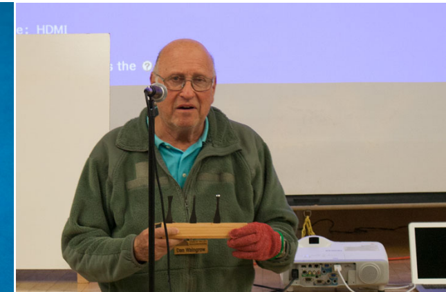
Dan Waingrow's carving bit holder