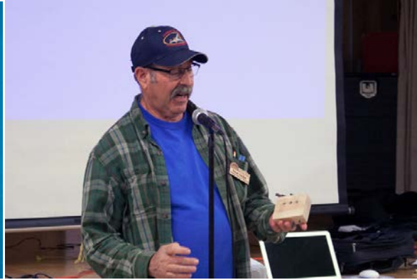
Dave Seidler's Hex wrench holder