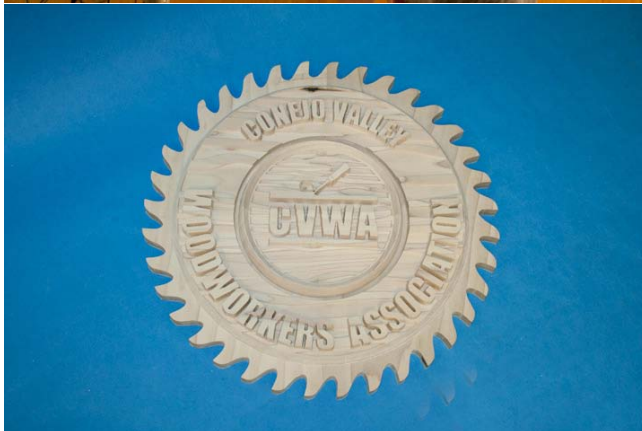
Video from Ed Reed