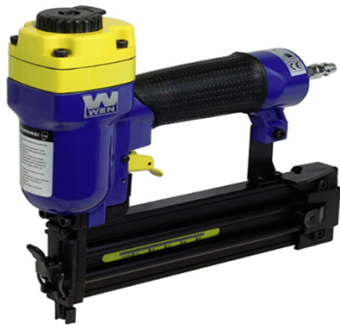
Wen 61720 3/4- inch to 2 inches; 18 Gauge Brad Nailer