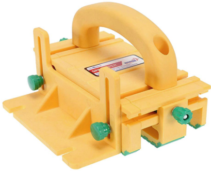
Grr-Ripper 3D Pushblock for Table Saws, Router Tables, Band Saws, and Jointers