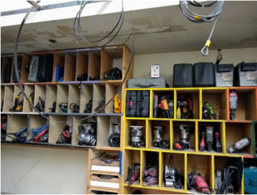
Tool Room - VERY Jealous!