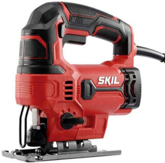
Skil Jig Saw/Corded