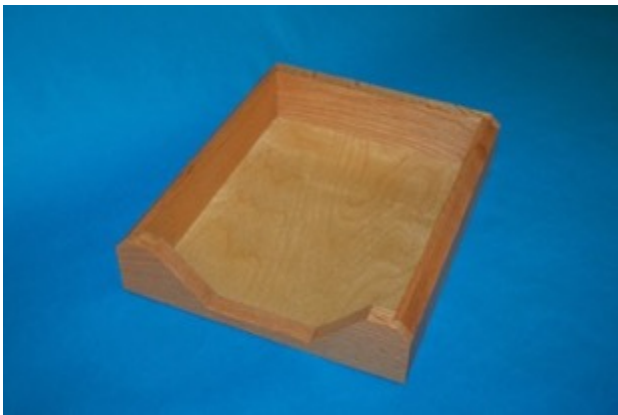
Oak Paper Tray

Walnut and Maple Pencil holder. (Walnut “borrowed” from Charlie North. LOL!)