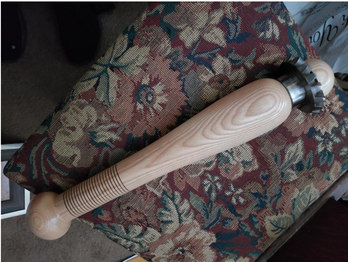
Stephen Case-Pall turned this old fashioned tire thumbper from a baseball bat blank.