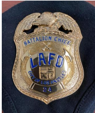
Not she's retired!