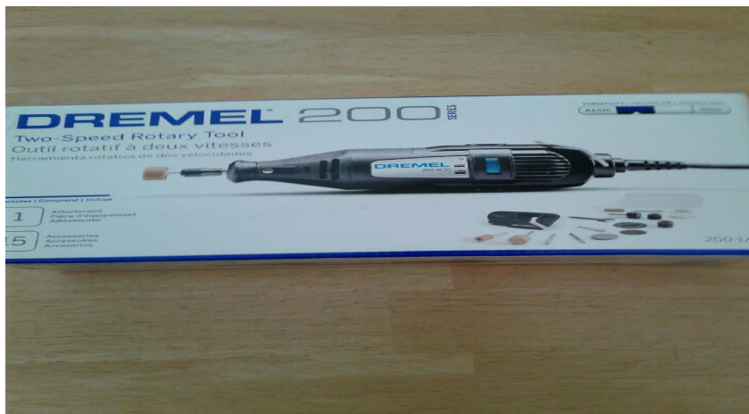
The Demel 200. This is a two speed rotary tool.