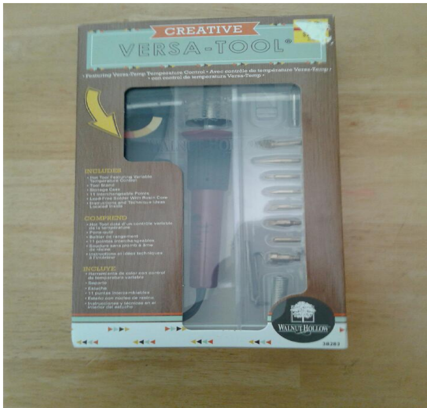
The Versa Tool is a wood burner with multiple tips