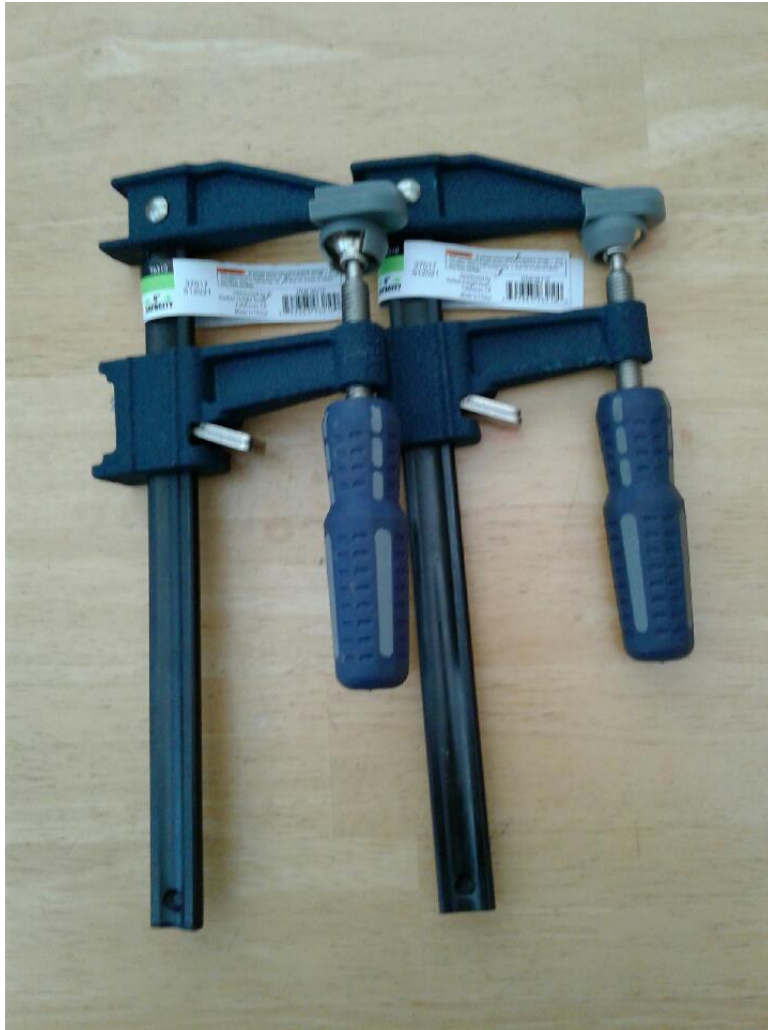
Table clamps to help hold your project.

Looking forward to seeing everyone at the next meeting. Stay safe and healthy.