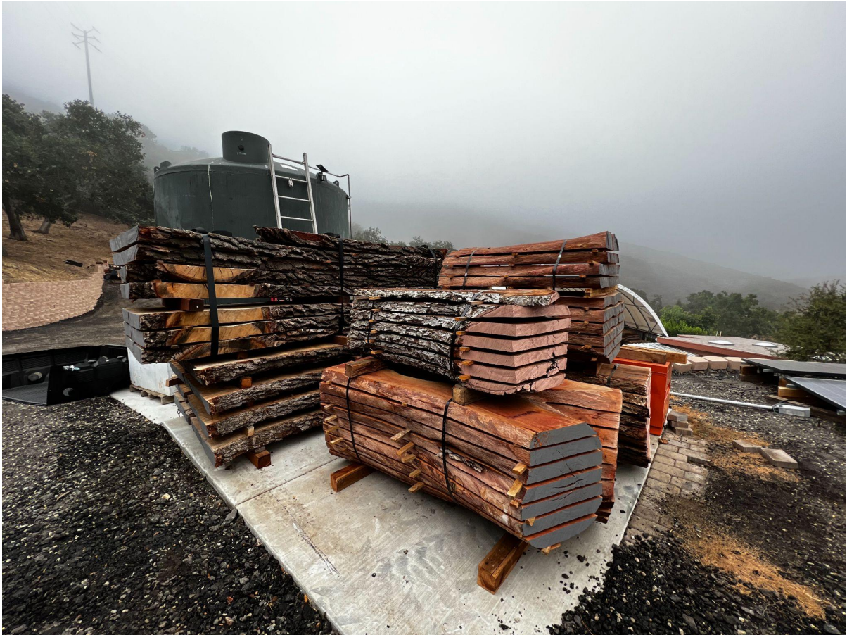
The “Wizard of Oz” Tree nearest to the tank!! GIANT Oak