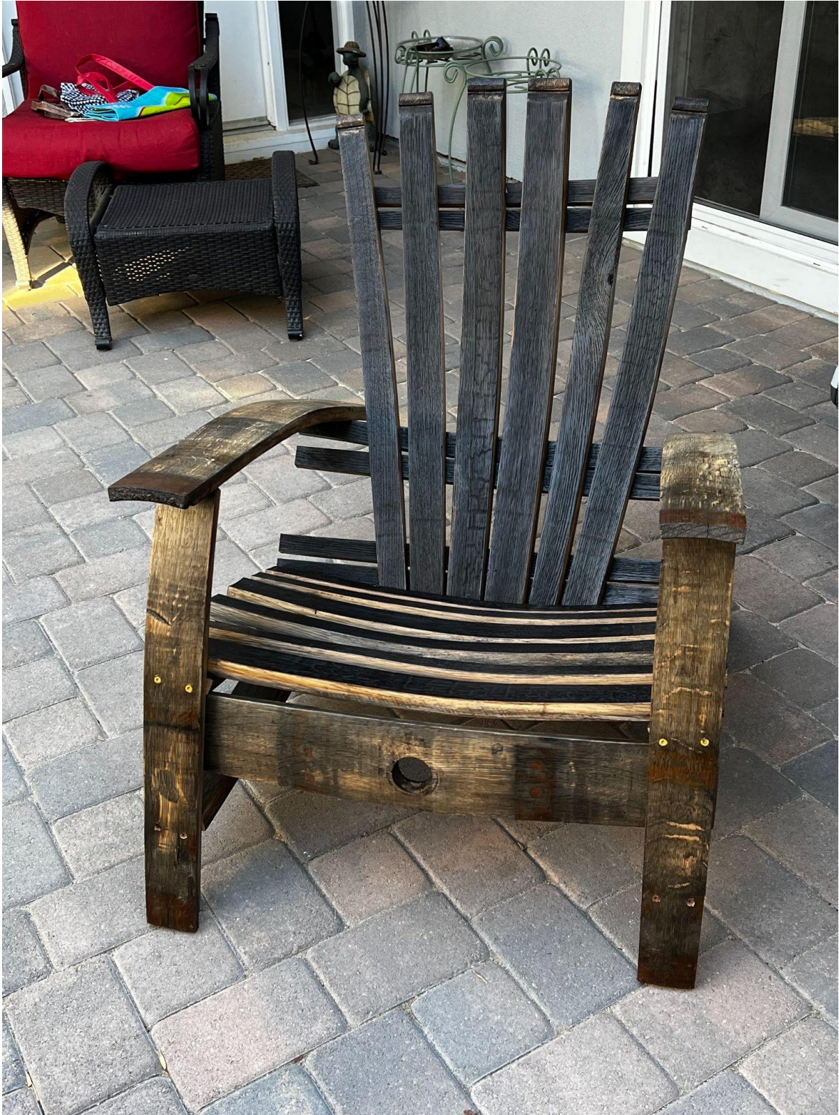
Wine Barrel Chair (27 staves) Oak