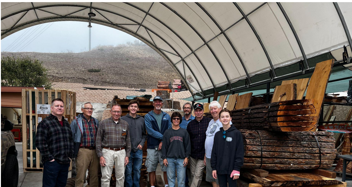
The Tour members all smiles