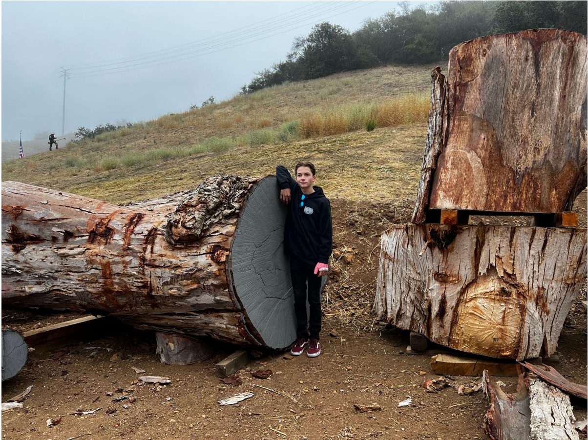
Don's Grandson next to a eucalyptus tree