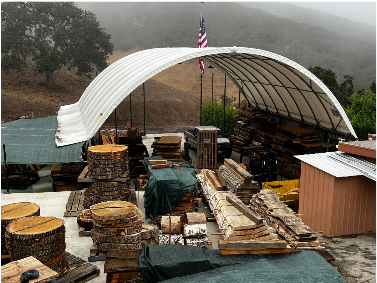
The Available Stock