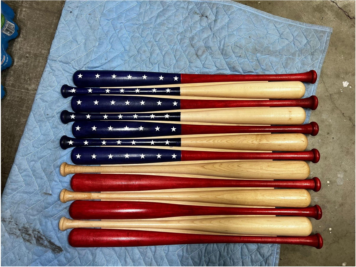
Stacy Gerlich- Baseball Bat Flag