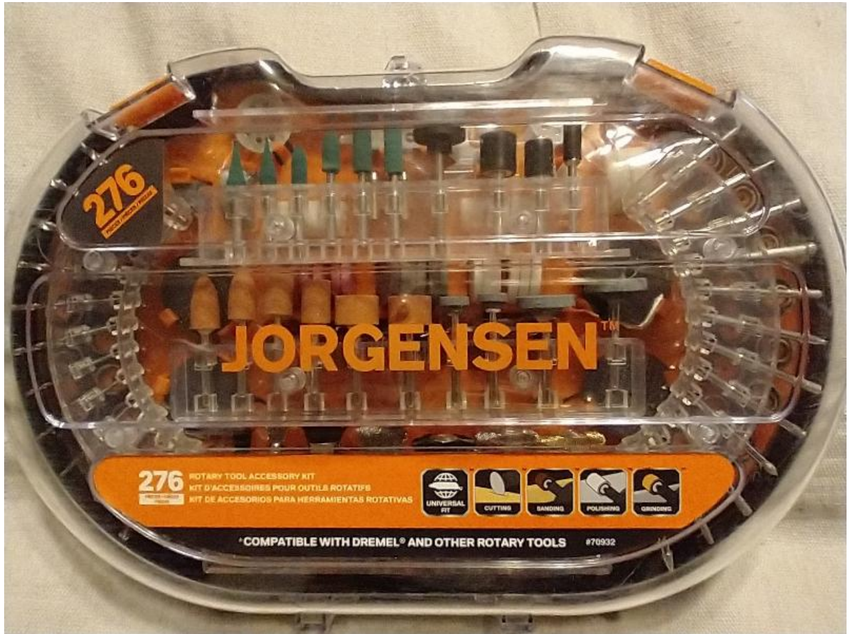
Rotary Tool Accessory Kit