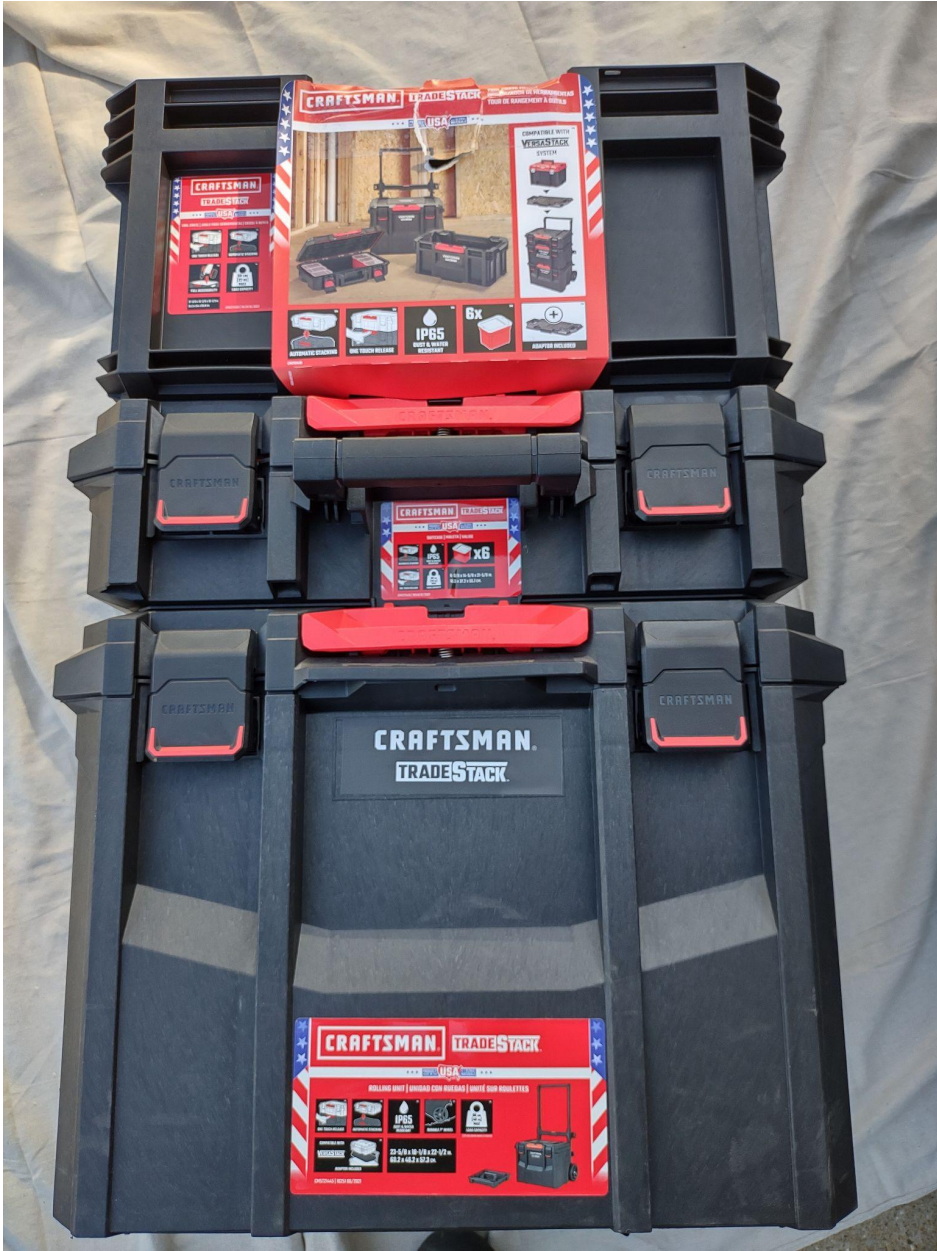
Tower Stackable Storage

Please remember to send your recent project photos to stacygerlich@gmail.com so we can post them in the following newsletter.