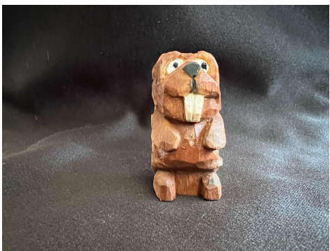
A small carving from Stacy. This is 1x1x2 basswood