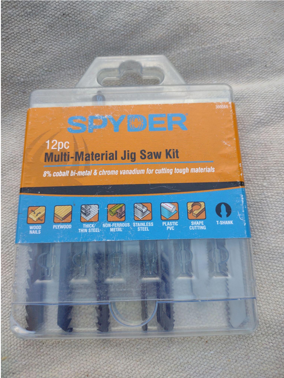
Jig Saw Blades