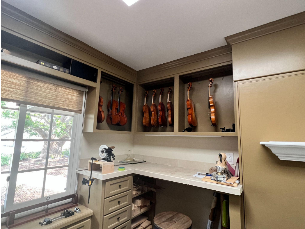
Just a few of her violins