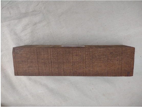
3x3x12" Walnut blank