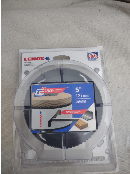
5" Hole Saw