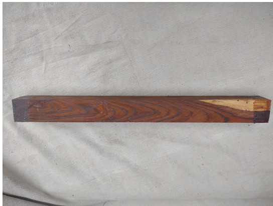
1.5x1.5x18" cocobolo wood blank