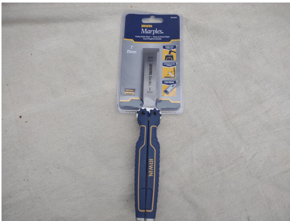
1" Folding Chisel