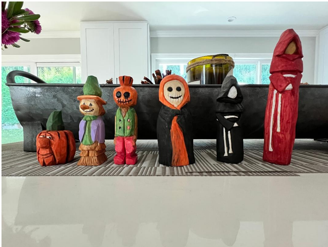
Basswood carvings by Stacy Gerlich