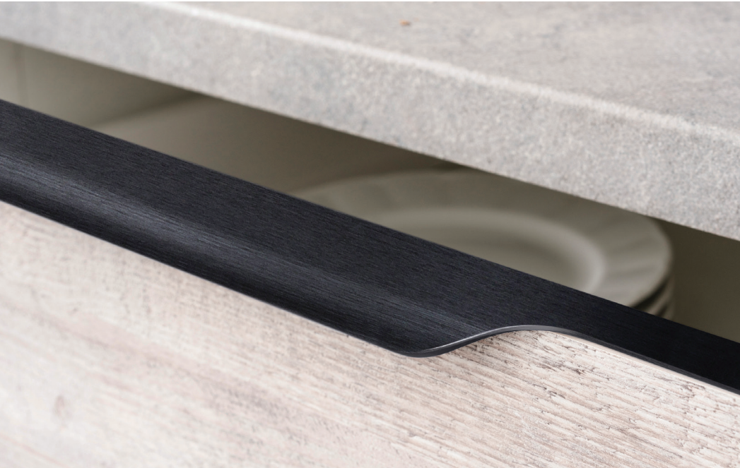
*Handle is pictured on a 20mm board

The Vector is a modern profile handle with an ergonomic design that incorporates soft lines and rounded edges, perfect for a wide variety of cabinetry styles.