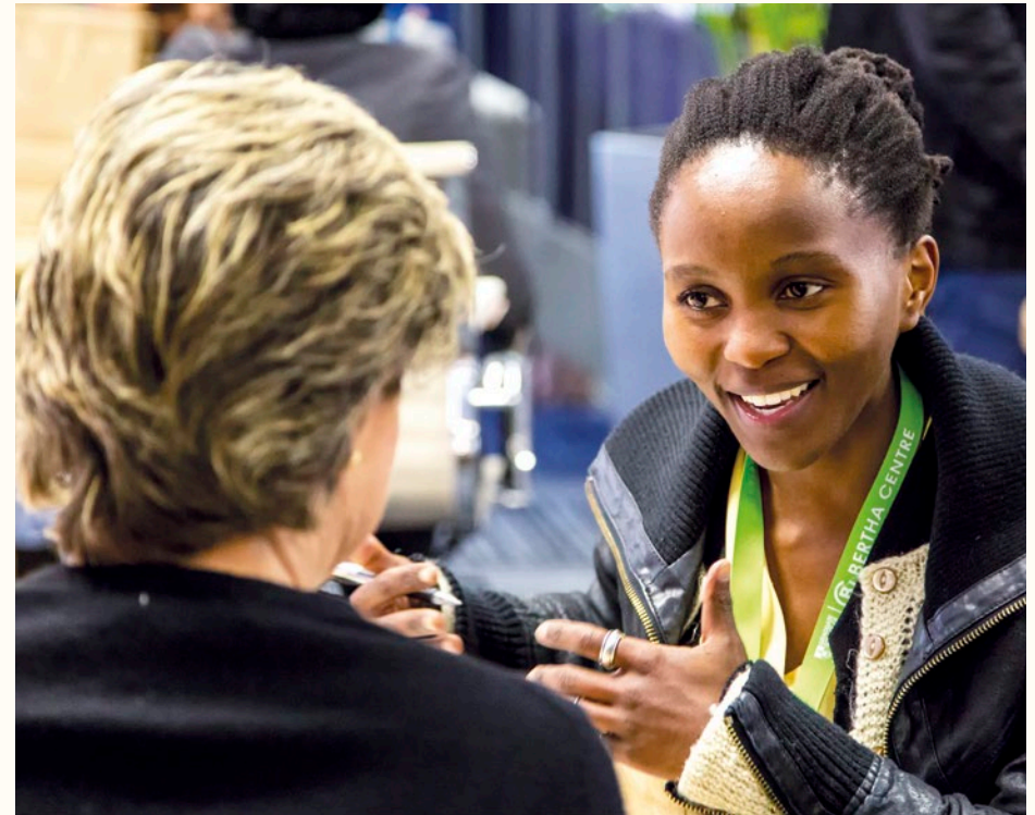
PATHWAYS TO FUNDING DO-FERENCE 2015