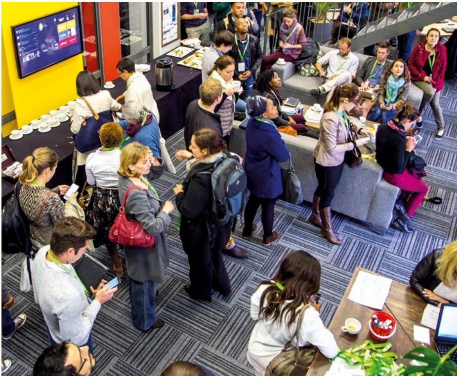
PATHWAYS TO FUNDING DO-FERENCE 2015