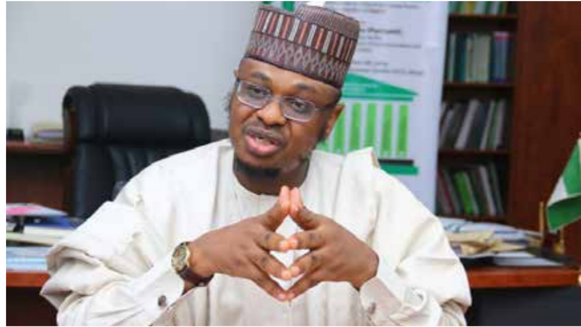
Dr. Isa Pantami

He explained that the first industrial revolution was about data generation. He said citizens submit their data to government or private institutions, some countries commercialise data and that is why the Nigerian government is we are very proactive in order to