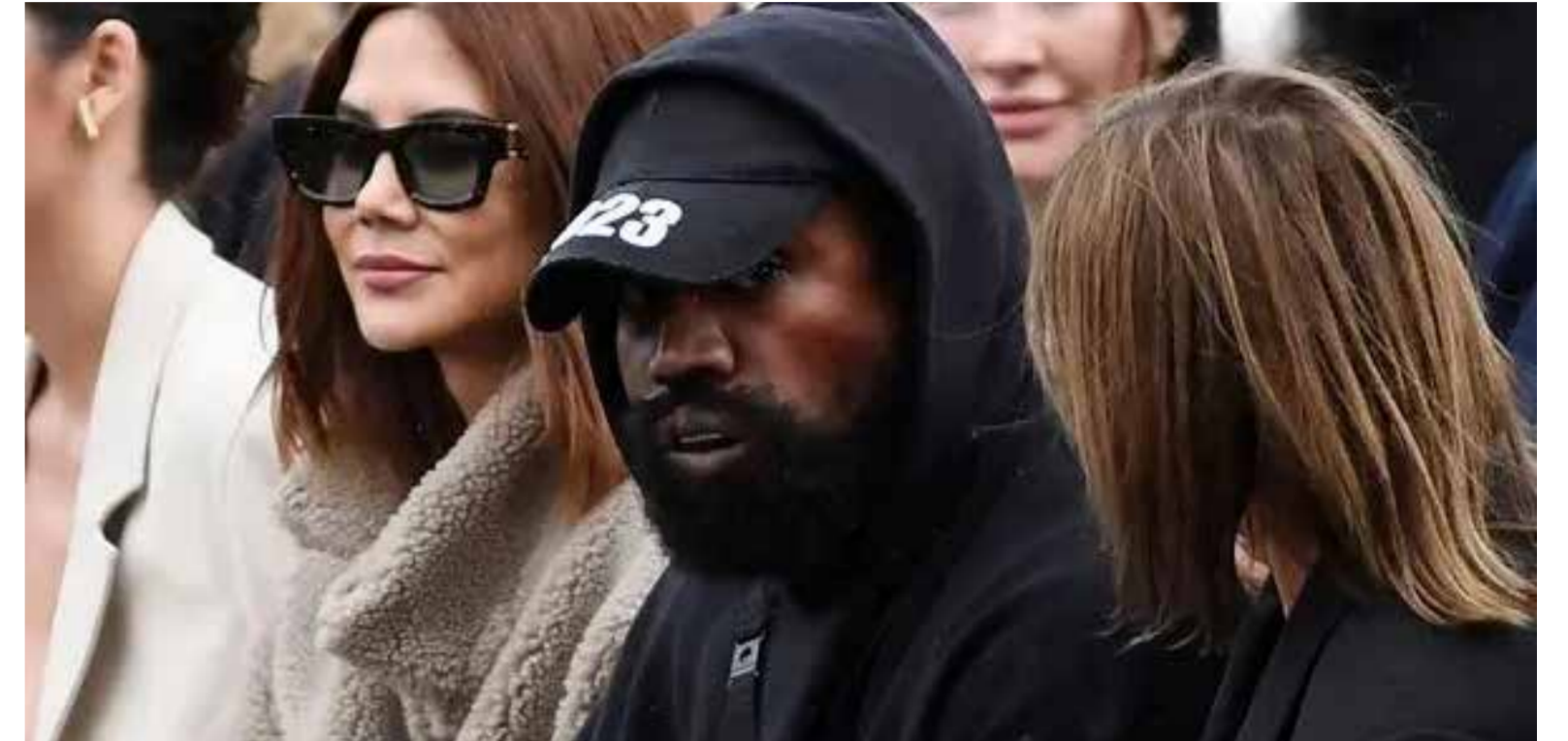
Rapper Kanye West

According to twitter, his comments go against the ethics of the site and as such deemed it necessary to suspend any further activities from his handle.