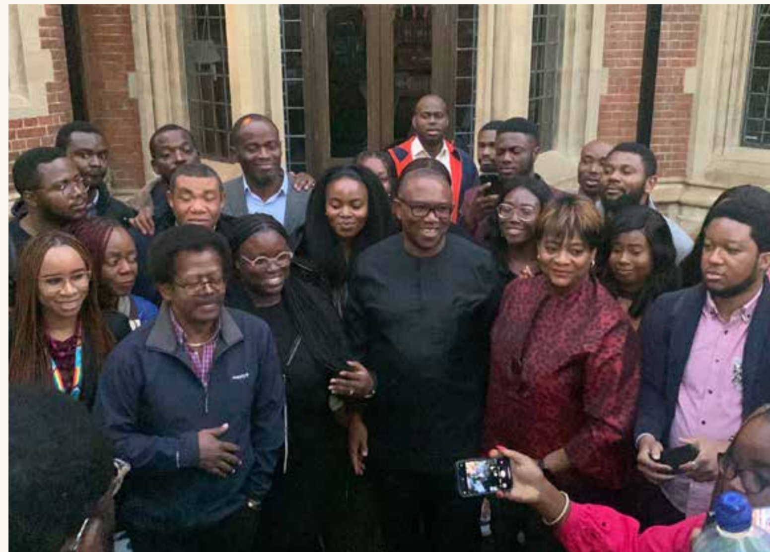
Peter Obi at Harvard

According to him, "Considering the fact that a lot of people are beginning to discover the country has been stolen to the point of stupor, and discovering the theft that is enough to take care of the Nigerian people and the ASUU strike. The theft that is taking place on the south south part of the country is enough to increase the