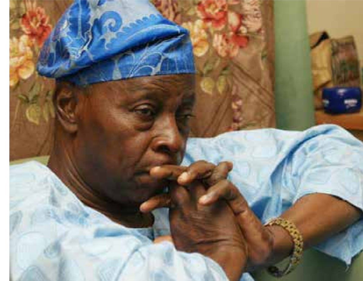
Chief Olu Falae