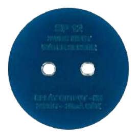
SP-12 (24VDC) Blue colored PCB