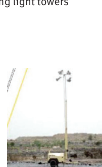
Blue Metal Quarry