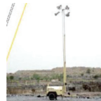
Blue Metal Quarry