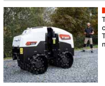
DUAL AMPLITUDE Two amplitude settings and centrifugal weights allow the TR75 to excel on a range of materials and job sites.