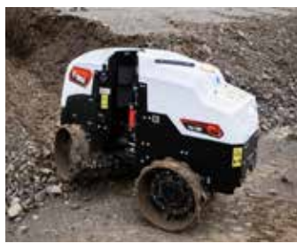
ARTICULATED JOINT Maintenance-free articulation joint with oscillation provides unmatched stability and perfect ground coverage.