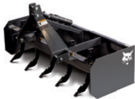
3 pt. box blade