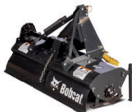
3 pt. tiller