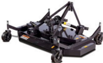
3 pt. finish mower