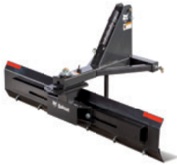
3 pt. angle blade