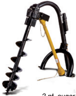
3 pt. auger

You can customize and accessorize your Bobcat compact tractor to improve productivity, enhance durability, maximize operator comfort and more. Simply choose options and accessories* that match your unique demands.