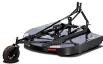
3 pt. rotary cutter