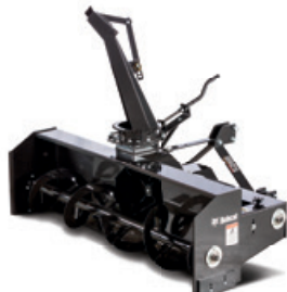
3 pt. snowblower