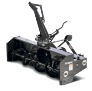
3 pt. snowblower