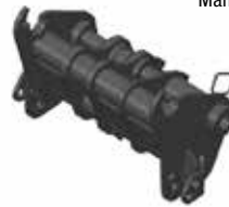
Manitou Carriage System (MT)