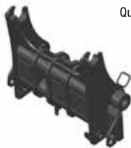
Quick-Tach System (QT)

Description: The extremely durable Bobcat digging bucket is ideal for all types of digging and materials handling jobs. Available with or without teeth.