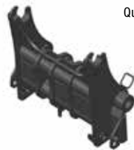
Quick-Tach System (QT)

Description: Built tough for reliability and endurance, the fork with grapple easily handle scrap, waste, brush and other hard to manage materials.