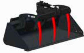
Farm/Utility Grapple: To be attached on bucket. It is recommended to use the port relief valve 6684646 for S450/T450 and larger