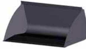
Light Material Bucket: No special requirement.