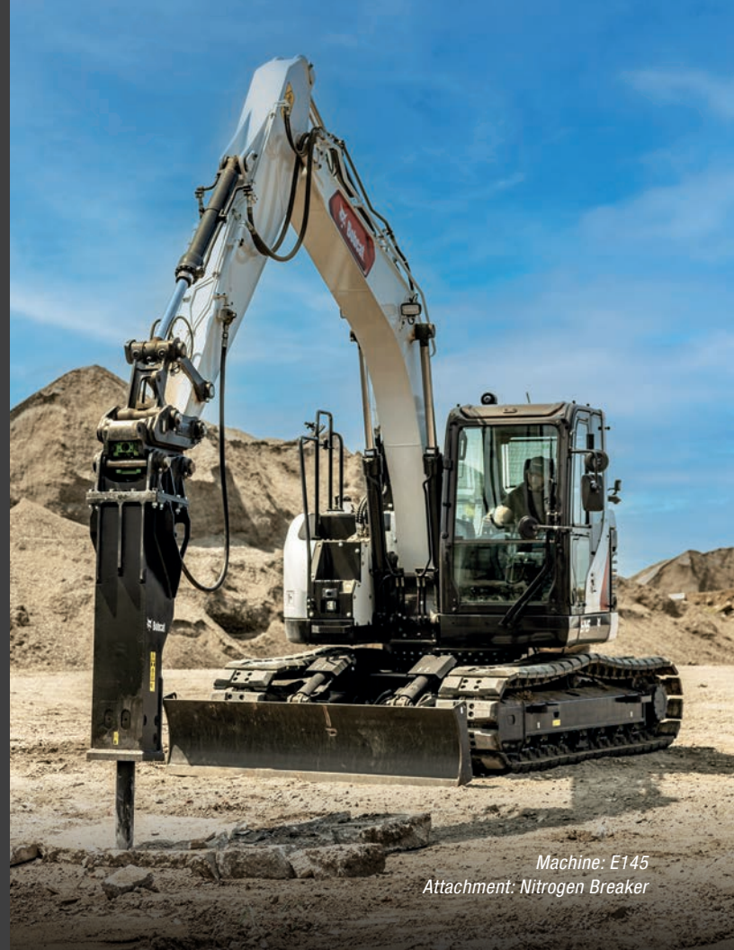
Machine: E145 Attachment: Nitrogen Breaker

Bobcat large excavators are optimized for productive, efficient attachment use. Their work modes, simple controls and attachment-focused features give you the ability to enhance performance for the task.