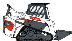
COMPACT TRACK LOADERS