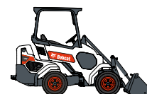
SMALL ARTICULATED LOADERS