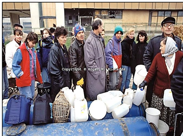
SARAJEVO WATER LINE 1992