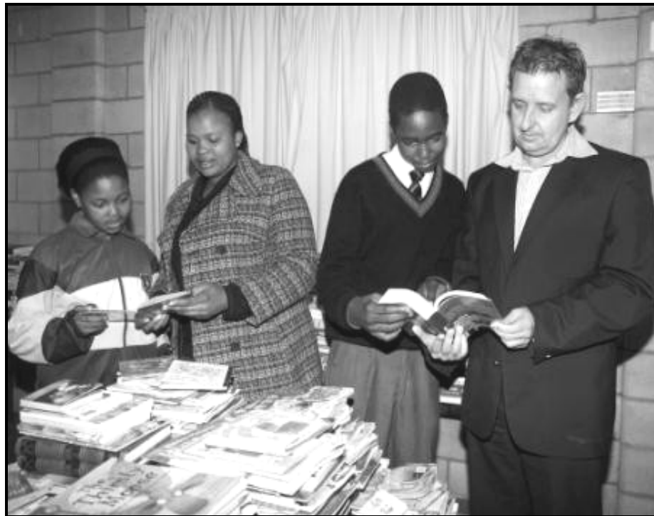
[Icashunwe kuwebhsayithi: www.library.com ]