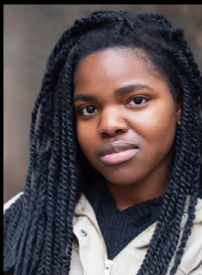
Francesca Amewudah-Rivers Othello