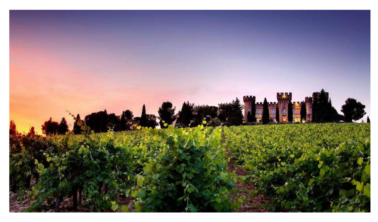
Château des Fines Roches

Located in the heart of the prestigious vineyards of Châteauneuf-du-Pape, this castle built in the late 19th century was inhabited by the Marquis de Baroncelli and frequented by many Provencal poets.