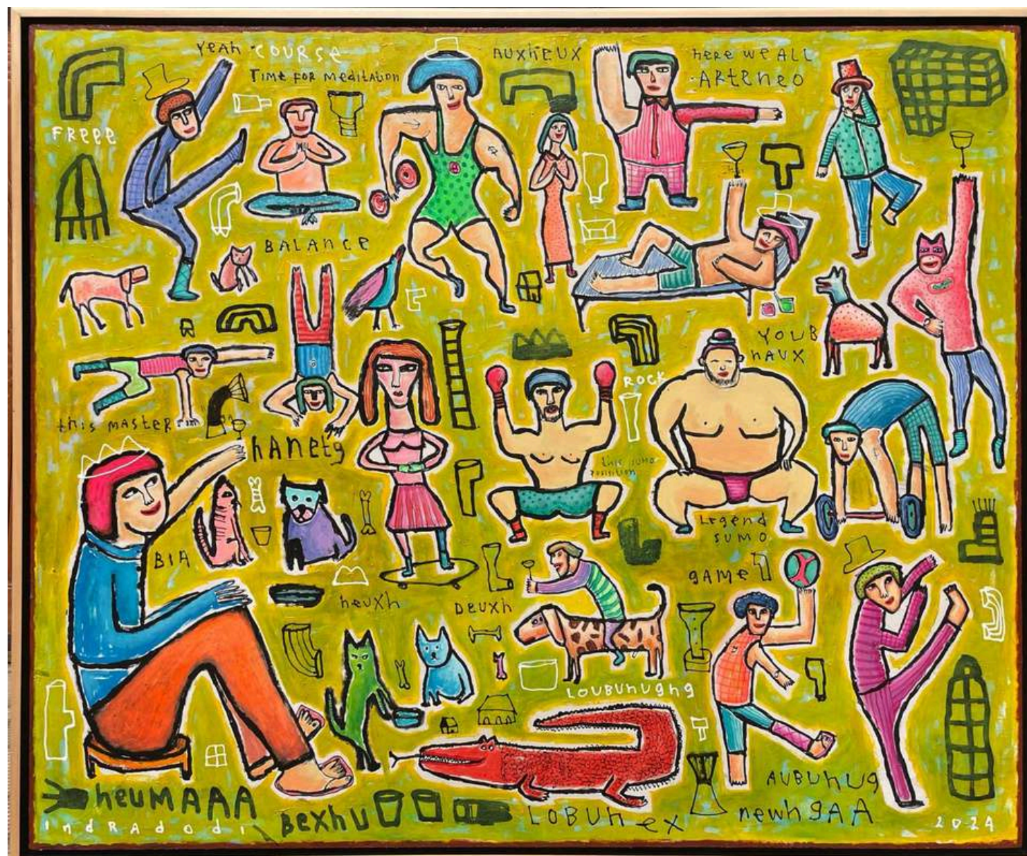
Some Day 120 x 150 cm Acrylic on Canvas 2024