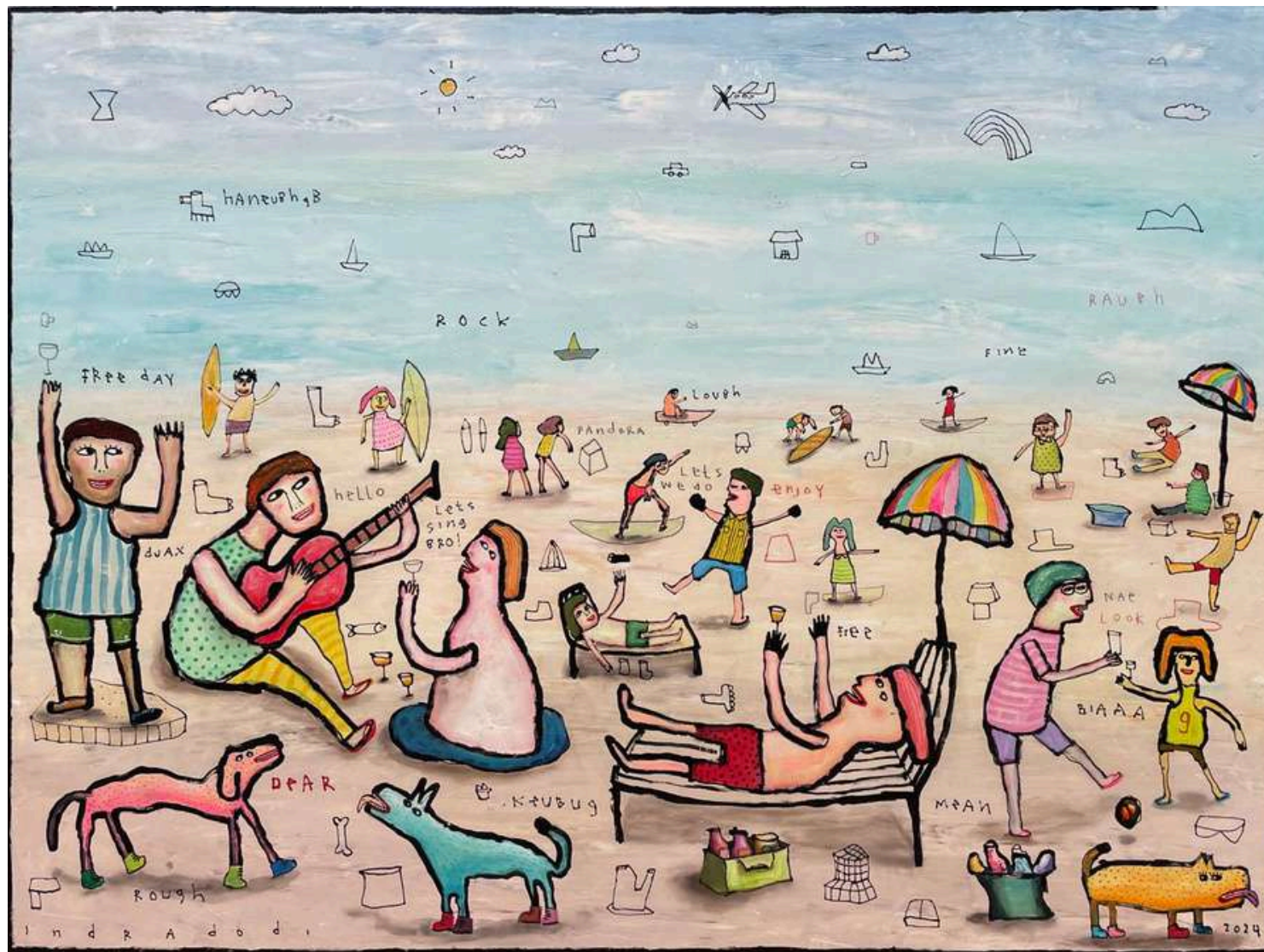
A Day at The Beach 120 x 160 cm Acrylic on Canvas 2024