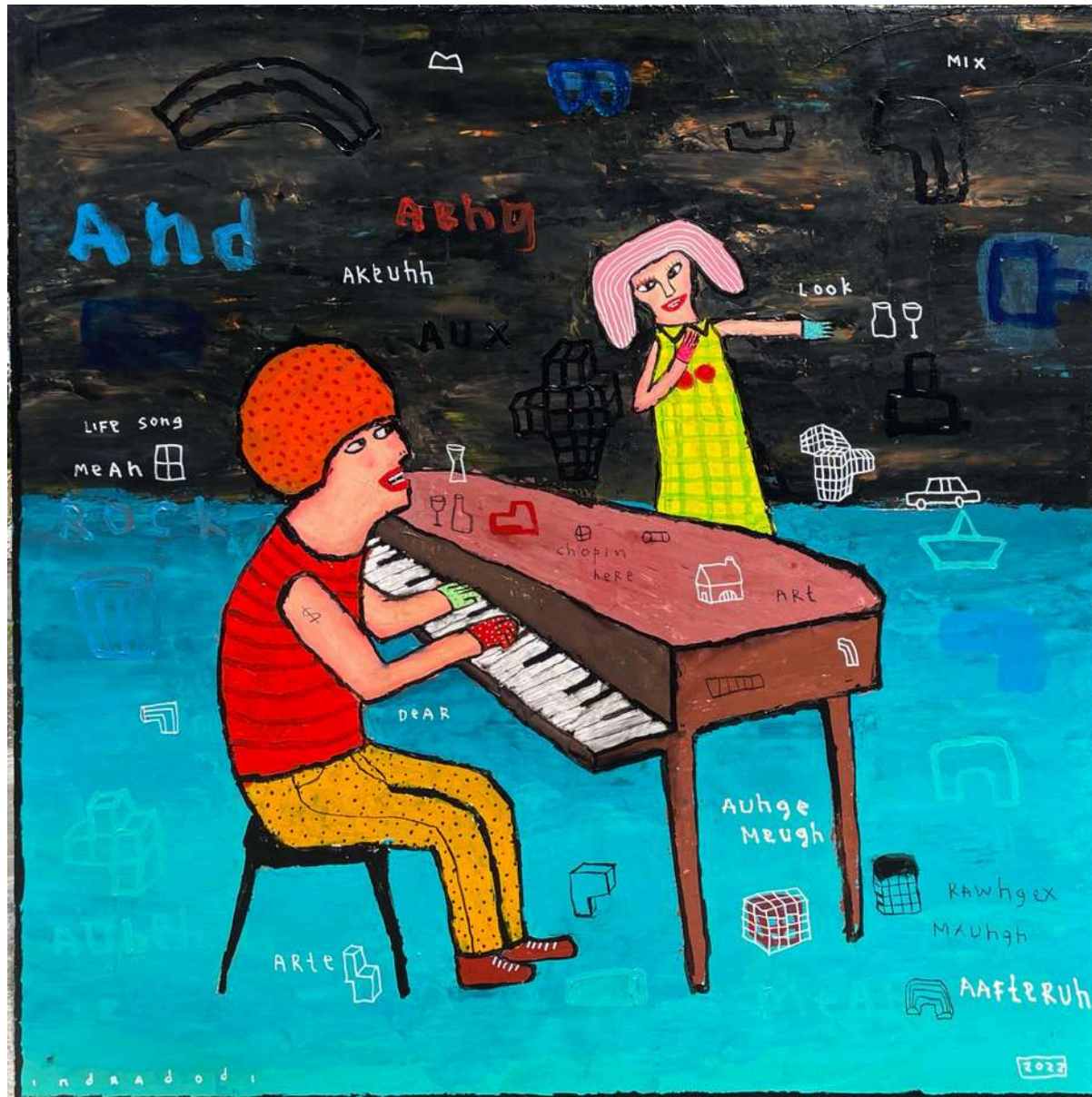
The Pianist 100 x 100 cm Acrylic on Canvas 2022