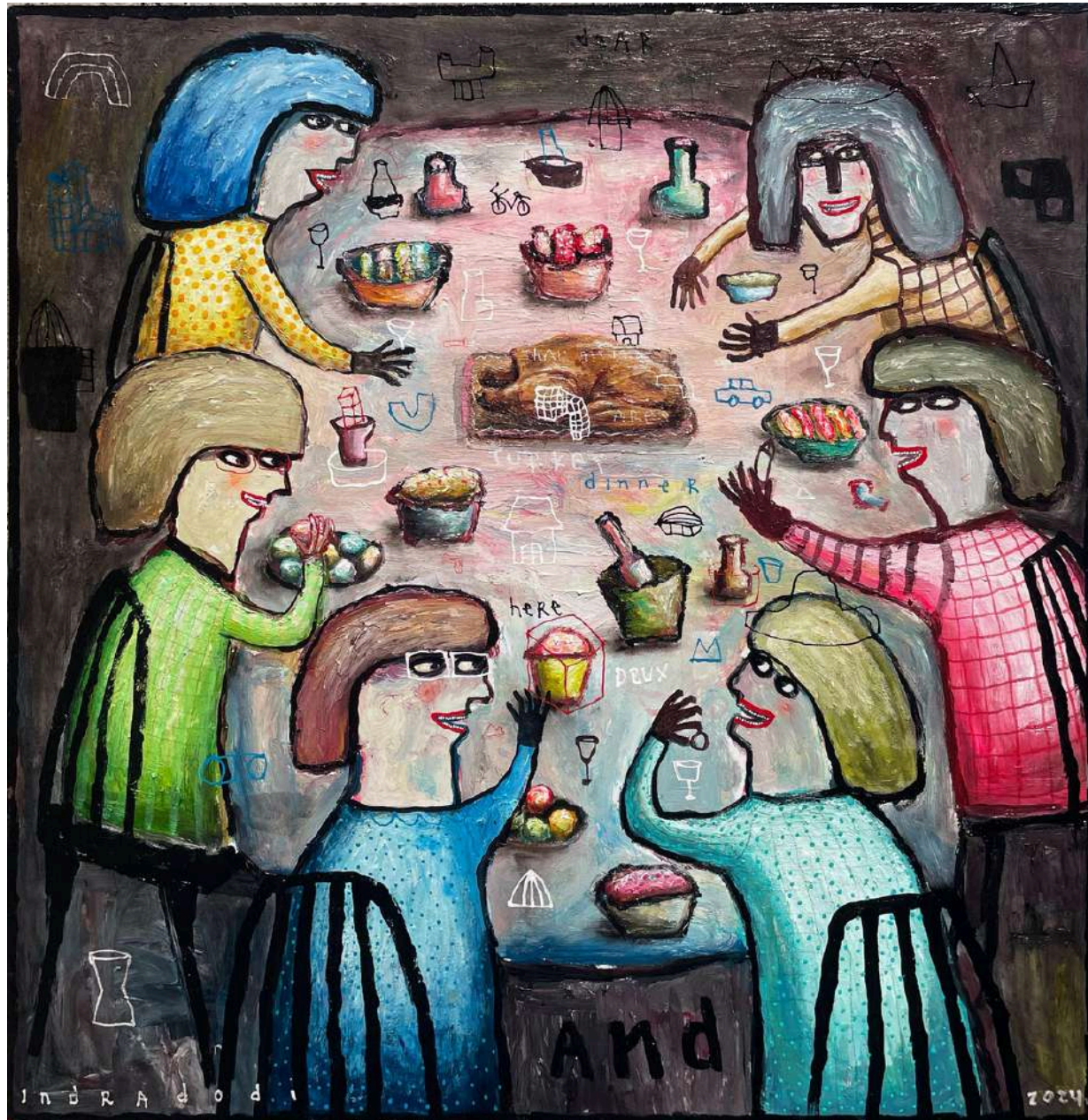
Thanksgiving Dinner 100 x 100 cm Acrylic on Canvas 2024