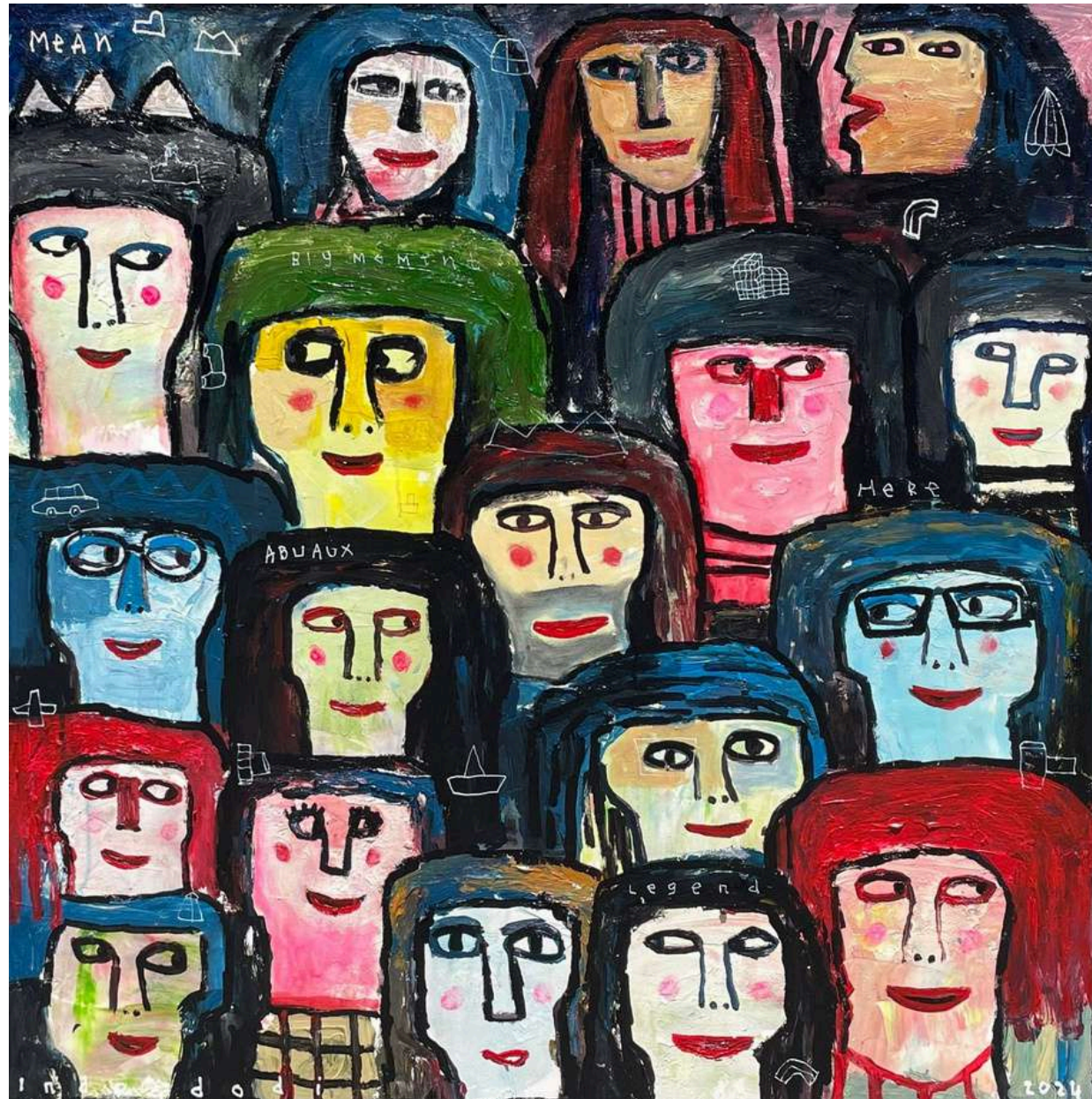
Rainbow of Thousand Faces 100 x 100 cm Acrylic on Canvas 2024