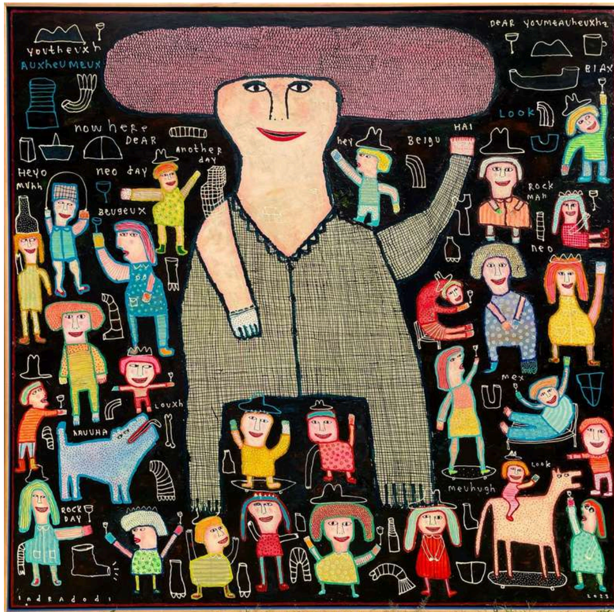
Balance 180 x 180 cm Acrylic on Canvas 2023