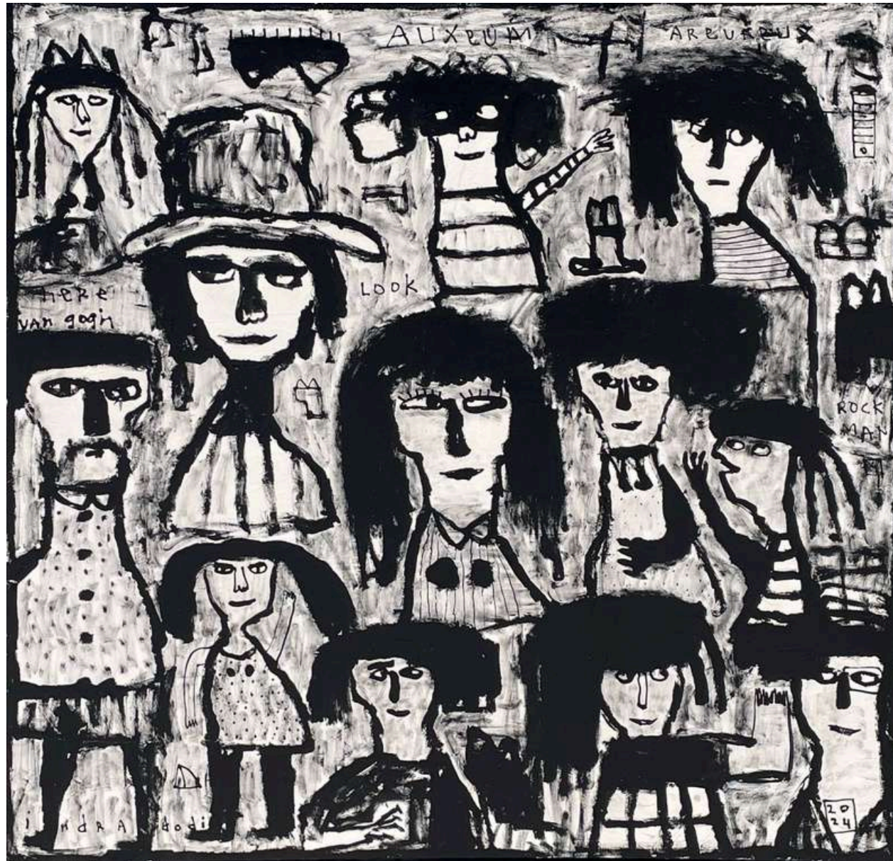
Monochrome Heart 100 x 100 cm Acrylic on Canvas 2024