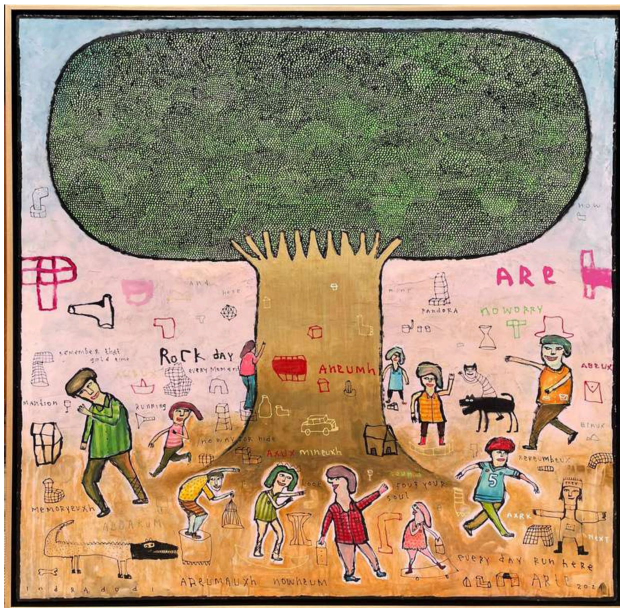
Hide and Seek 150 x 150 cm Acrylic on Canvas 2024