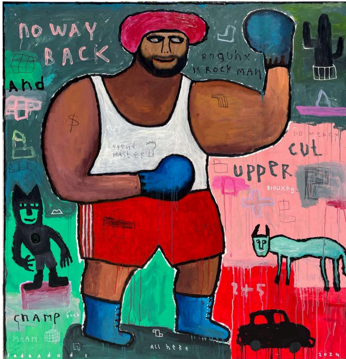
The Champion 175 x 165 cm Acrylic on Canvas 2024