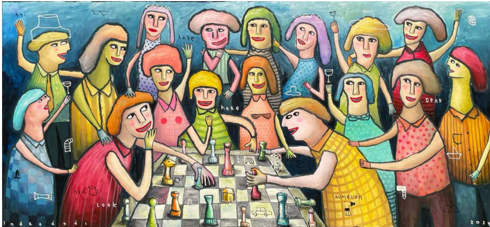
A Game of Chess 80 x 180 cm Acrylic on Canvas 2024