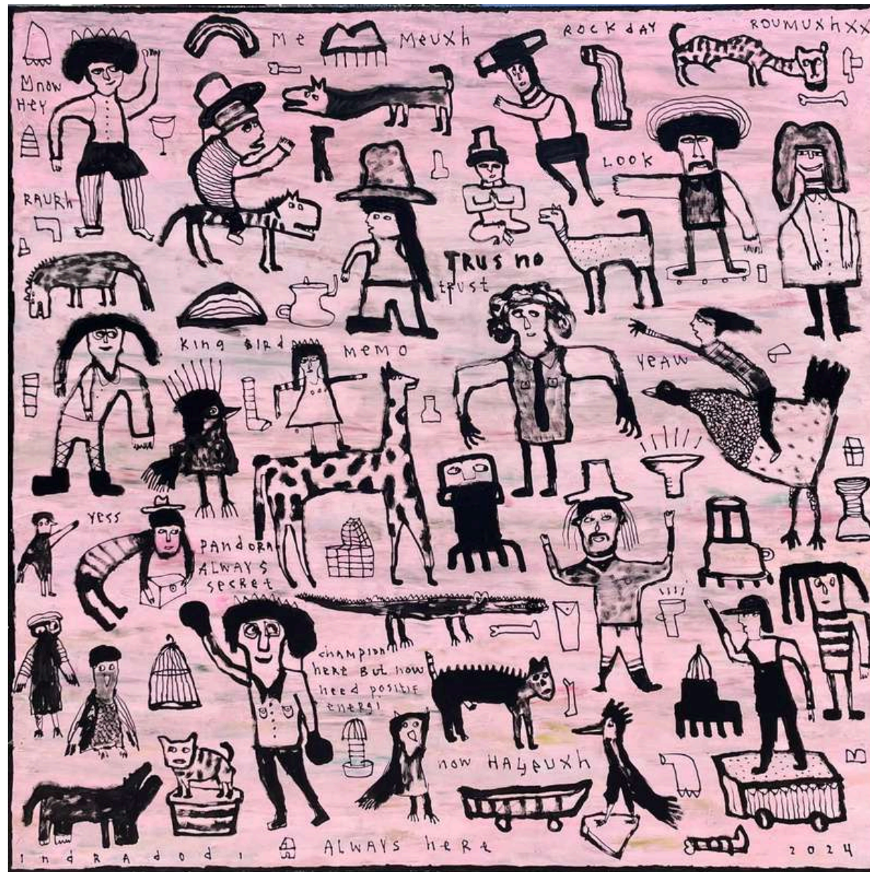
Adventure Time 130 x 130 cm Acrylic on Canvas 2024