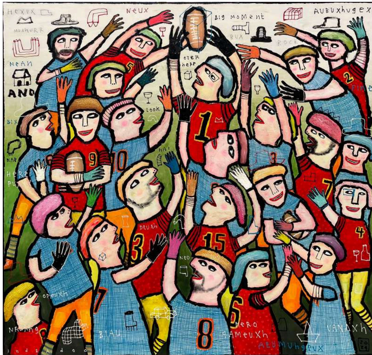
Rugby Match 160 x 170 cm Acrylic on Canvas 2024