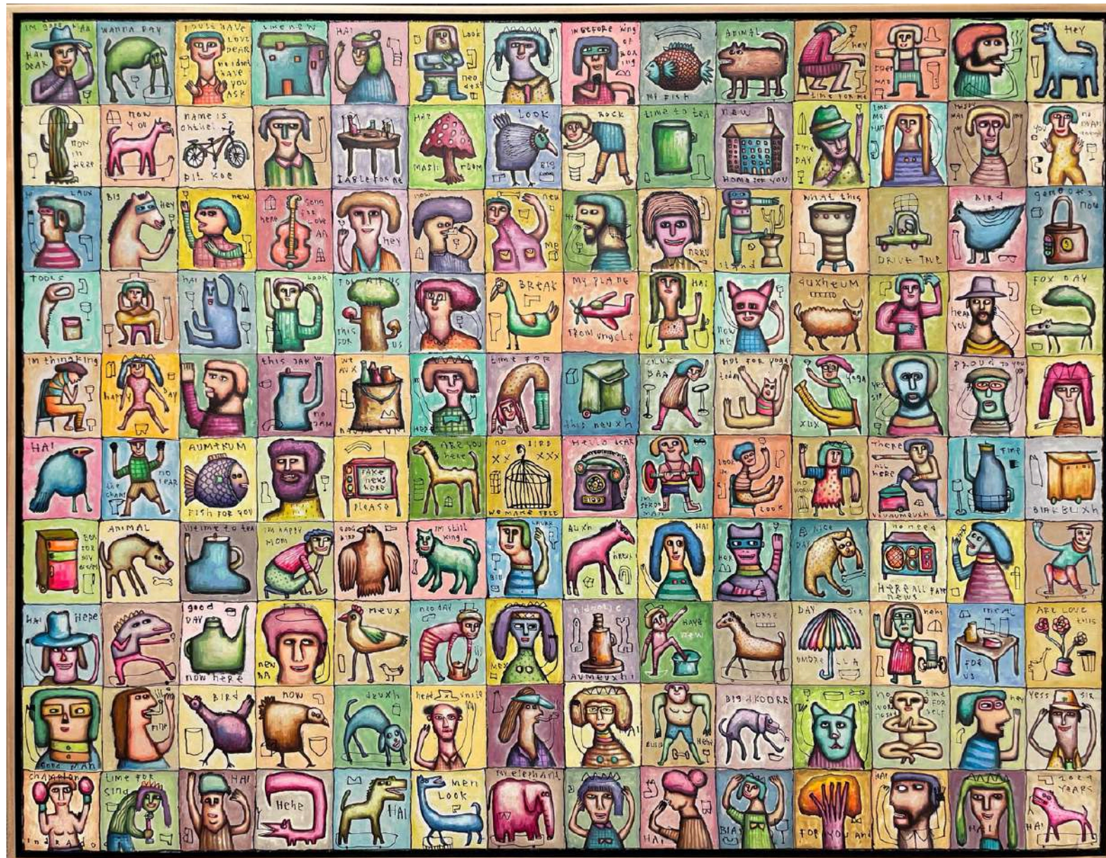
Kaleidoscope 150 x 200 cm Acrylic on Canvas 2024