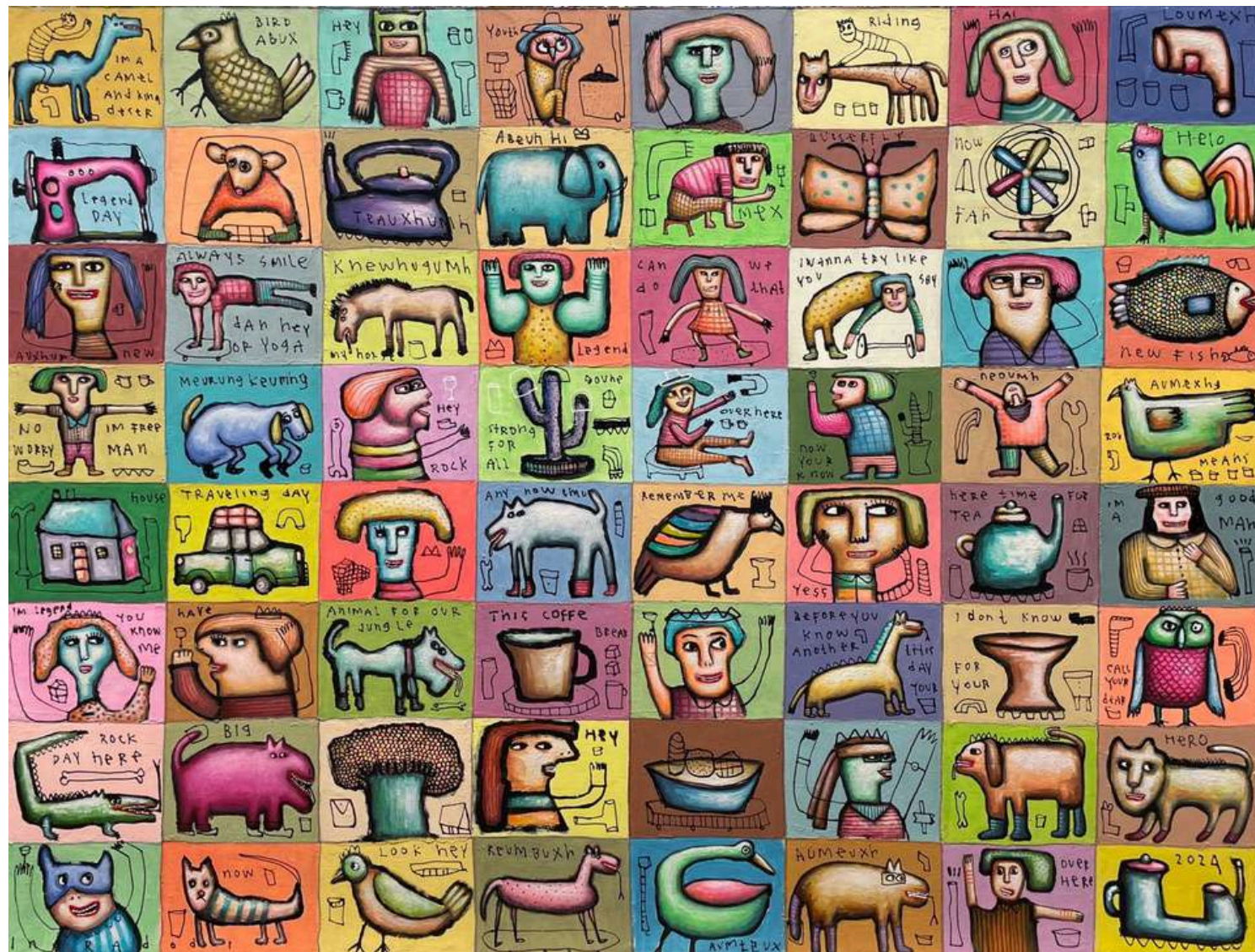
Kaleidoscope No. 6 120 x 160 cm Acrylic on Canvas 2024