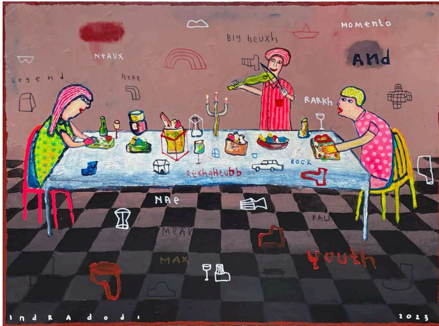
It's a Date! 60 x 80 cm Acrylic on Canvas 2023