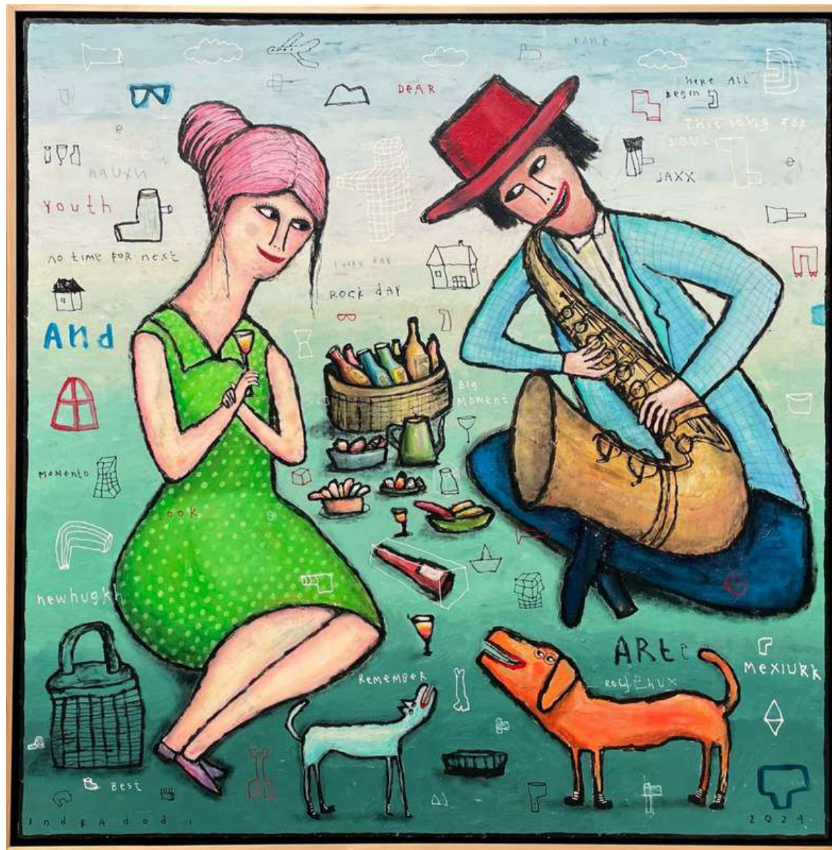
Romantic Moment 150 x 150 cm Acrylic on Canvas 2024