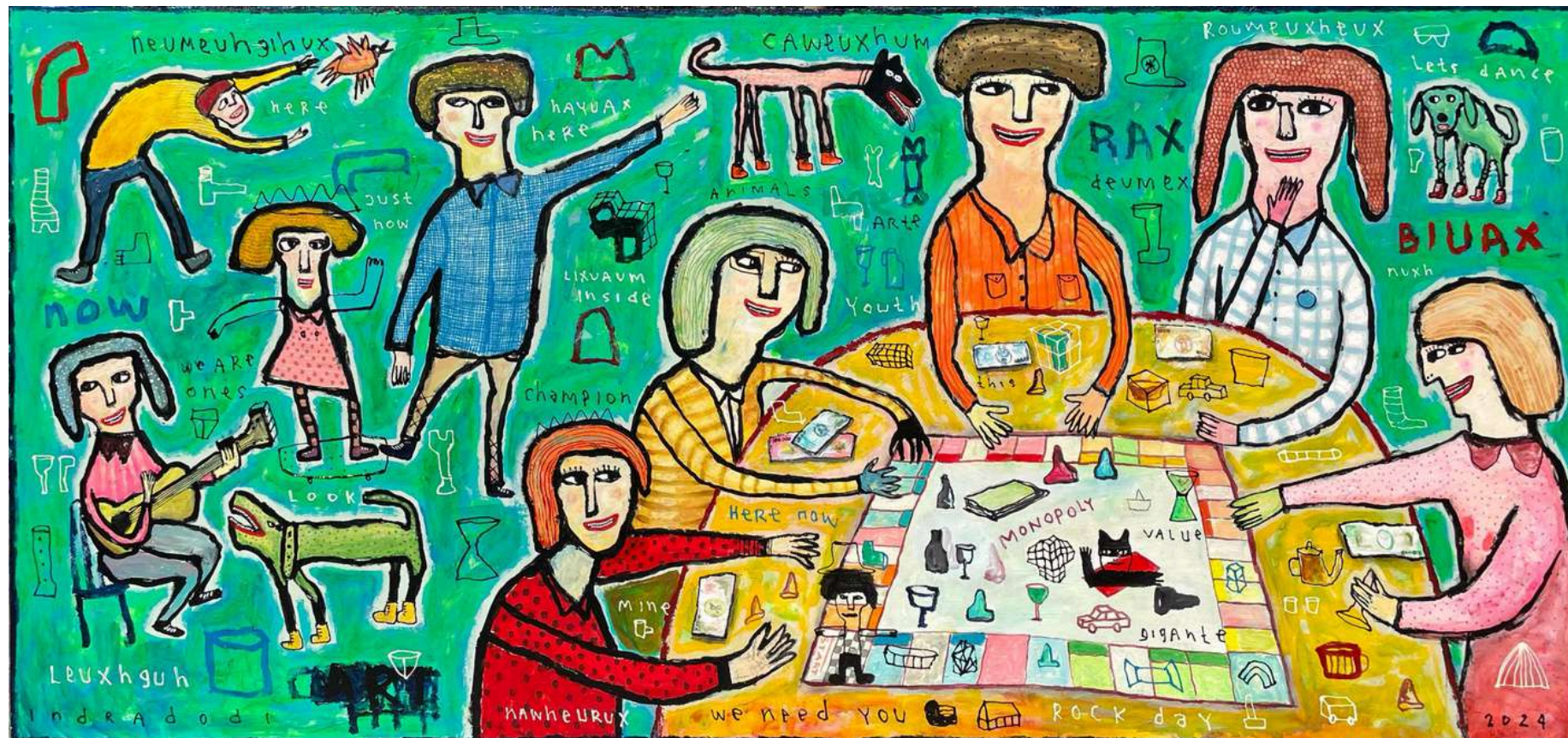
Monopoly 80 x 180 cm Acrylic on Canvas 2024