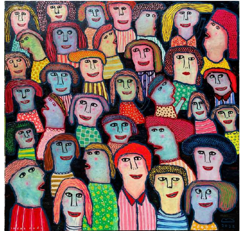
Colour of Faces 100 x 100 cm Acrylic on Canvas 2022

Childlike but bold and expressive, Dodi's oeuvre retains a quintessential Indonesian rawness. His art conveys the angst of growing up: a bittersweet phase where one struggles to grapple with the change from a wide-eyed child to a socially cognizant not-yet- adult, a rebellious era where one dreams of establishing a sense of self after taking a bite of the ever-delicious apple of independence. Wisdom is a double- edged sword—comprehension comes at a price, and something is always lost when knowledge is gleaned. Children learning to cope with the world drives the pathos behind his naïve figurative paintings. Adults are acclimatized to perceiv- ing the world as rational, while children see the world through the lens of wonder. Just as a child learns to make sense of the universe around them, Dodi frequently questions the universally accepted laws of order. Why must objects be of a certain colour? Why should we follow ratios and proportions? Thus, in Dodi's art, each stroke is a careful calibration of defiance, a desperate attempt to hold fast to the fleeting of innocence. His works are not just a visual poetry of willfulness, but also a question: if given a chance to begin again, whether one would choose to pay the price of biting the apple.