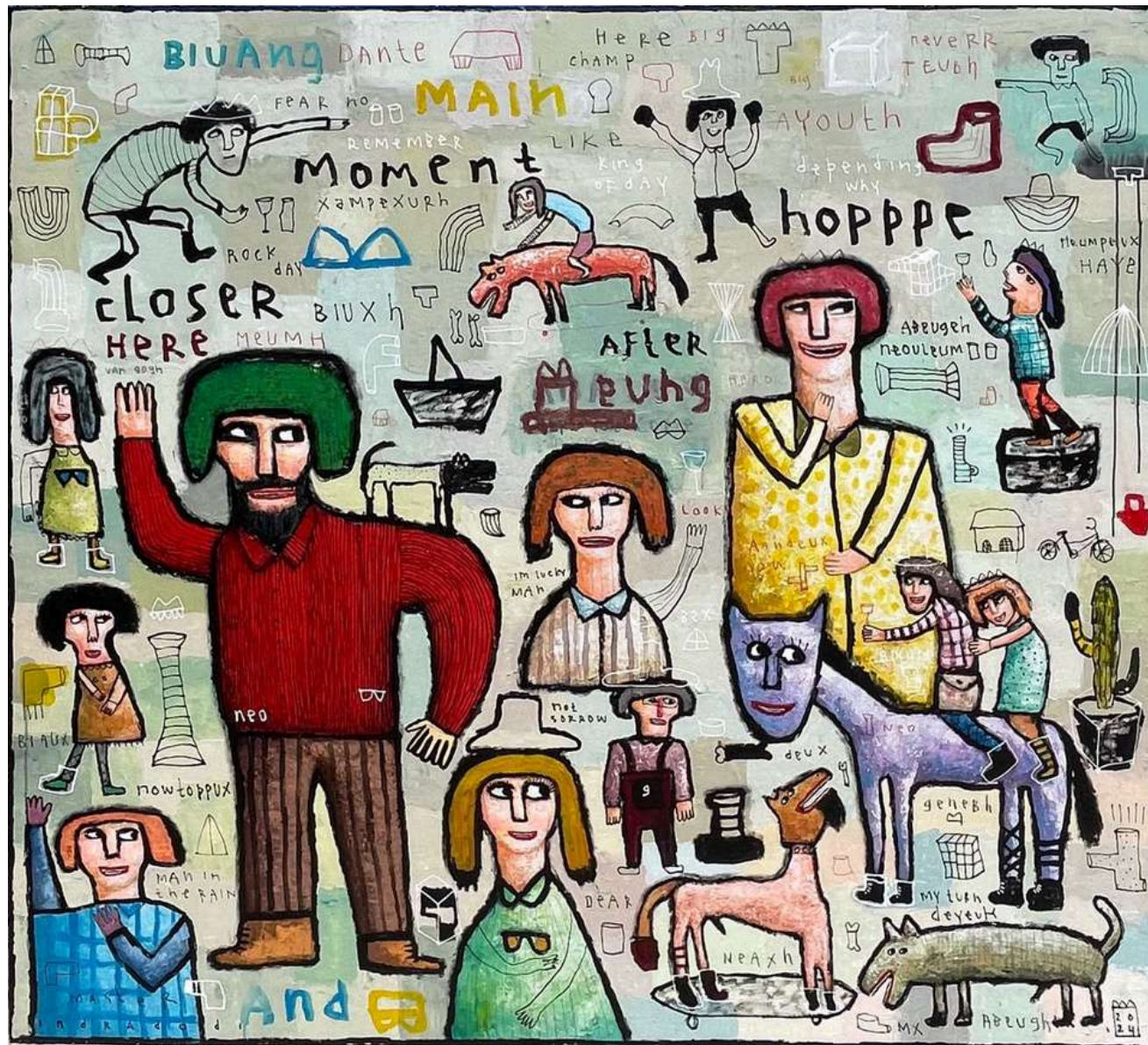
It's a Story for Another Day 160 x 180 cm Acrylic on Canvas 2024