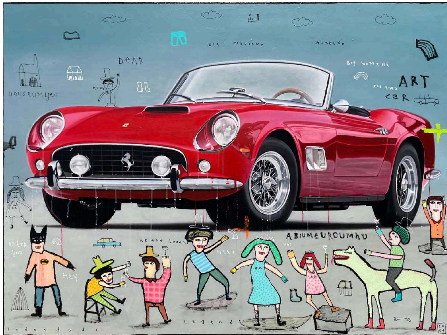
The Red is Bright 150 x 200 cm Acrylic on Canvas 2024