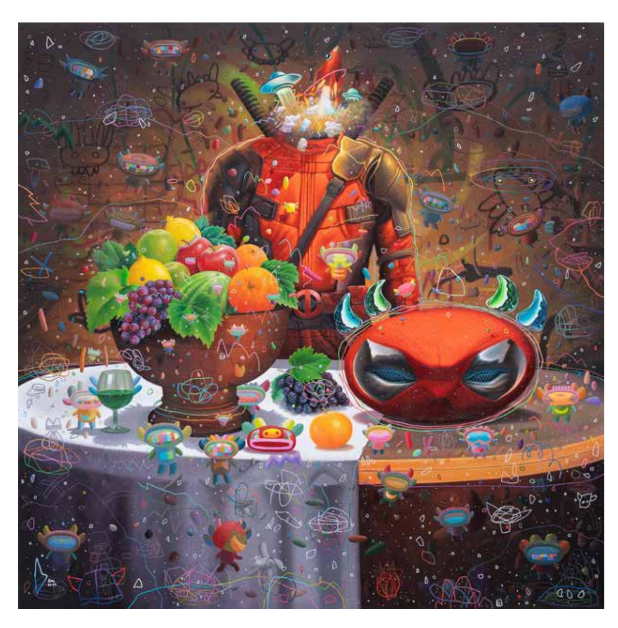
Deadpool 180 x 180 cm Acrylic on Canvas 2023