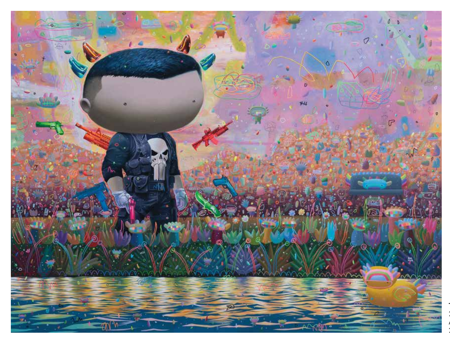
The Punisher 200 x 150 cm Acrylic on Canvas 2023