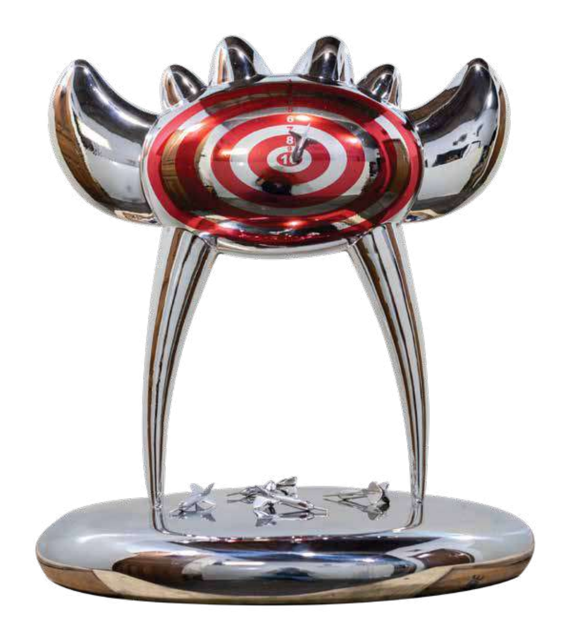
Still on Target 40 x 38 x 13 cm Acrylic on Canvas 2023