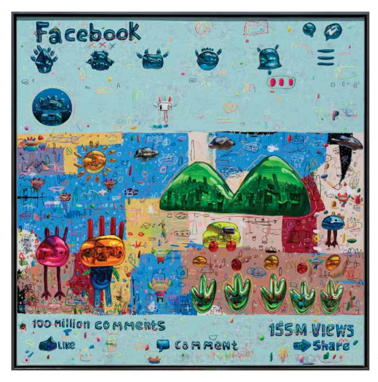
Facebook 180 x 180 cm Acrylic on Canvas 2023