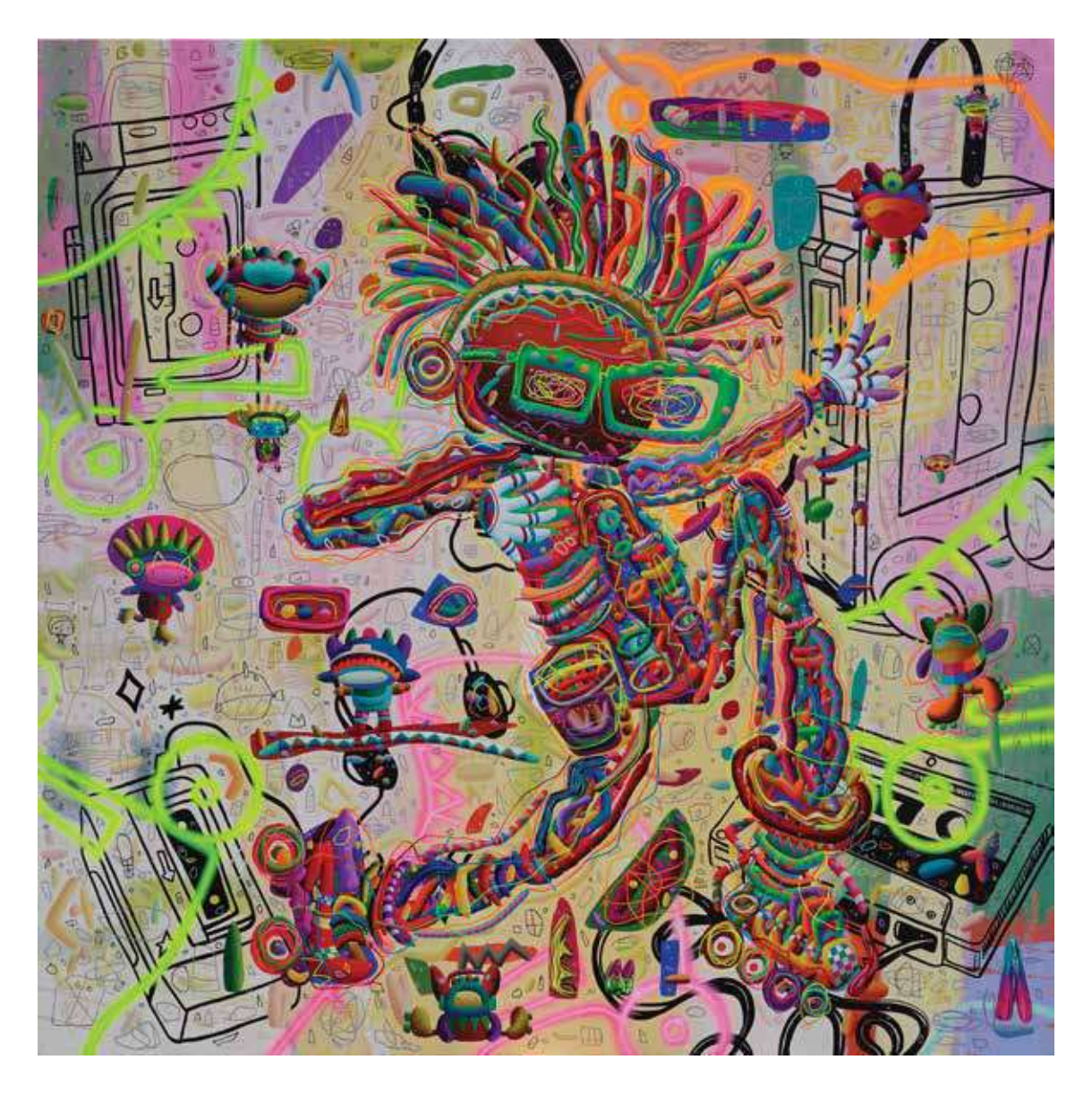
The Roller Skate 180 x 180 cm Acrylic on Canvas 2024