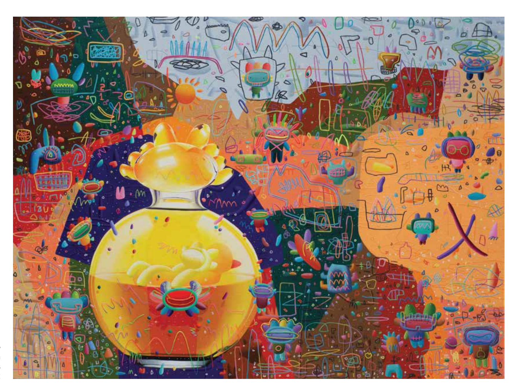
Message in a Bottle 200 x 150 cm Acrylic on Canvas 2022