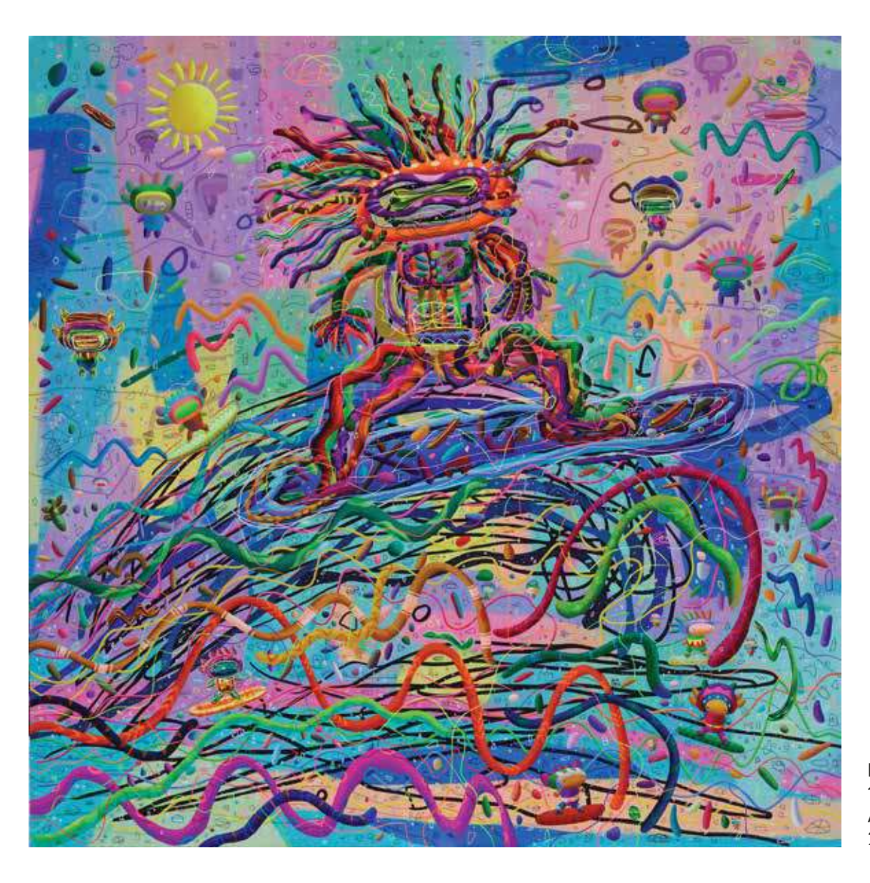
Riding the Wave 180 x 180 cm Acrylic on Canvas 2024