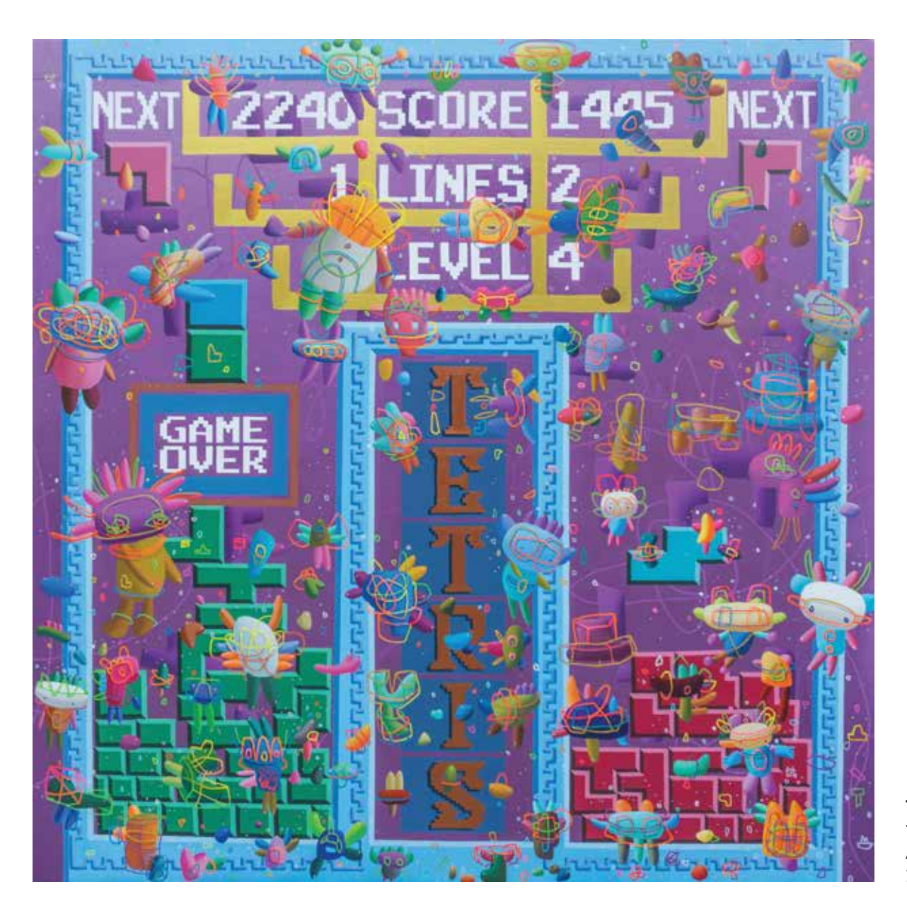
Tetris 180 x 180 cm Acrylic on Canvas 2019