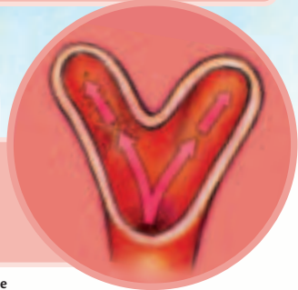
Coffey infographic with information from the National Stroke Association

Once the clot breaks up, normal blood flow resumes, and temporary stroke-like symptoms disappear.