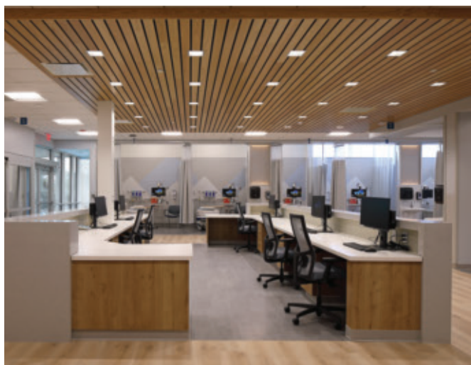
Post-Operative Nurses Station at the Claire C. Brodesser Surgery Center. The center has 22 patient bays.