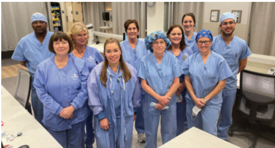
The caring and compassionate staff of Cape Regional Surgical Services.