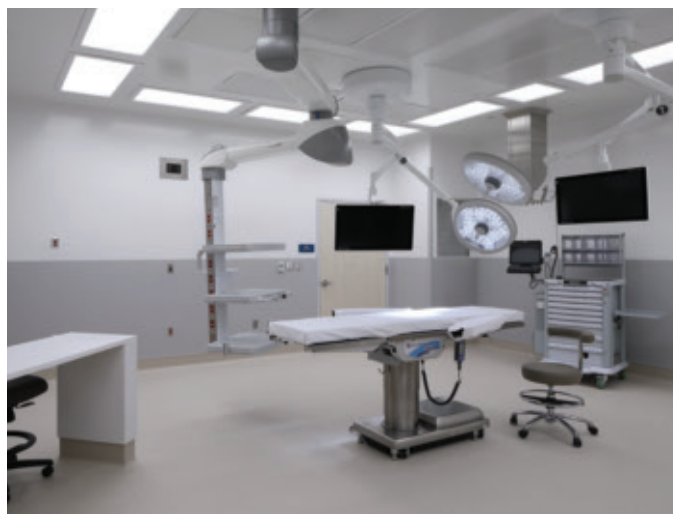
Operating Room at the Claire C. Brodesser Surgery Center. The Center has four operating rooms and two large endoscopy suites.