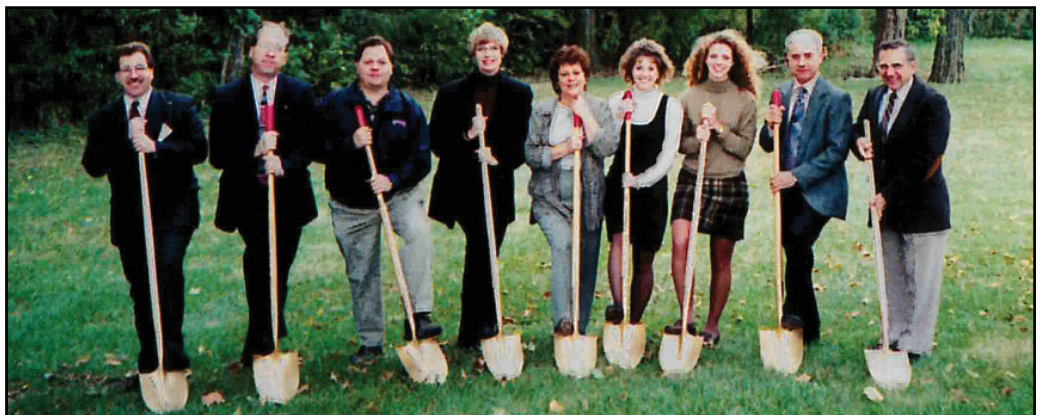
The ground-breaking ceremony of the original Memorial Garden in October 1997.